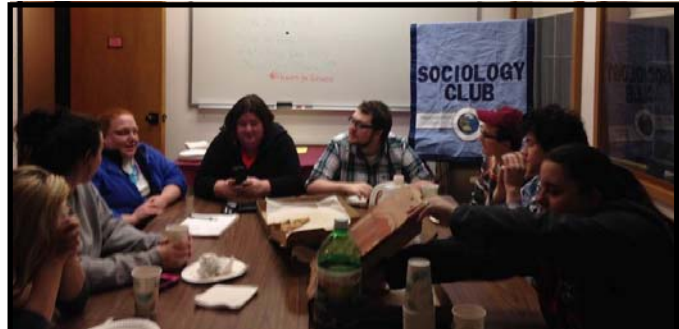
Students participate in a Sociology Club meeting that included a movie and pizza!

stride in raising awareness and benefits for the Bangor Area Homeless Shelter, the Sociology Club participated in the 21st Annual Hike for the Homeless. Joining to make a difference, our club walked 3.5 miles to meet 1,100 fellow participants at the Bangor Waterfront. Our members are proud to have advocated for people experiencing homelessness and contribute to the raising of $36,000 in benefits for the shelter."