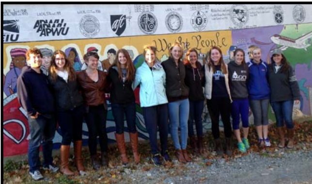
Sociology Club members join others from UMaine to volunteer at Food AND Medicine to help prepare for the annual Solidarity Harvest meal basket giveaway.

clubs, Circle K and Rotaract. Preparing for Food AND Medicine's 12th Annual Solidarity Harvest, our members worked on cleaning and organizing storage and office spaces and stacking wood! The Solidarity Harvest provides meal baskets to families of laid-off workers and community members. Last year, 1,200 meals were distributed to families throughout the state and the need is growing. We had a wonderful time learning about their mission and volunteering to support our local community."