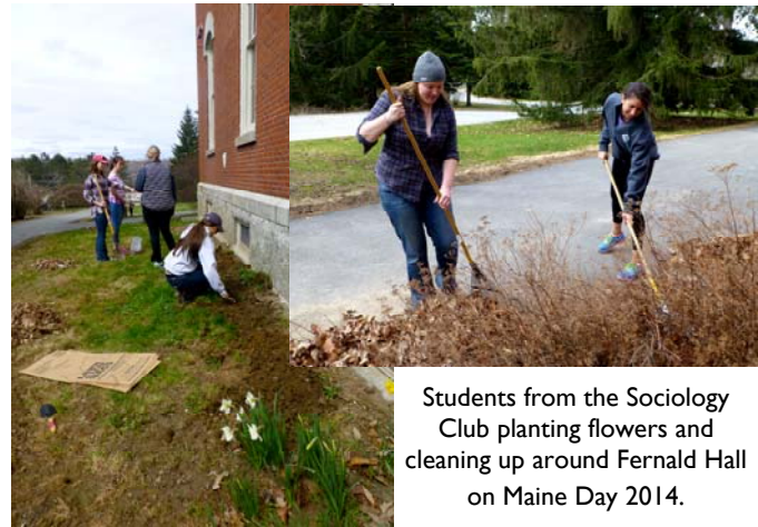
Students from the Sociology Club planting flowers and cleaning up around Fernald Hall on Maine Day 2014.

Aside from being involved in the everyday activities of RJP and serving as a conference facilitator, I had the opportunity to present research and data on the restorative process at the Center for Undergraduate Research (CUGR) Academic Showcase in April. The CUGR showcase is a great experience because you have the chance to show the academic community, and anyone else who shows up, what research you've done and you have the chance to see what other students in different disciplines have been doing. Participating in the showcase and speaking about RJP and their research has also provided me with a an opportunity to practice for presenting at the ASA Honors Program, held in San Francisco this August. I will be traveling there with