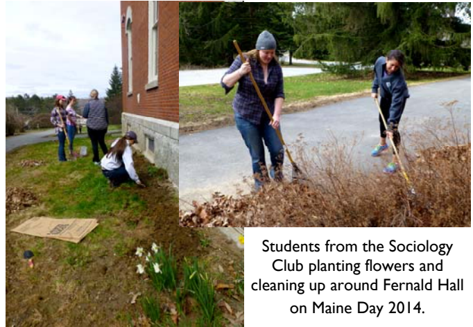
Students from the Sociology Club planting flowers and cleaning up around Fernald Hall on Maine Day 2014.