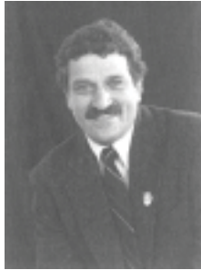
From the Desk of Senator Bruce Bryant