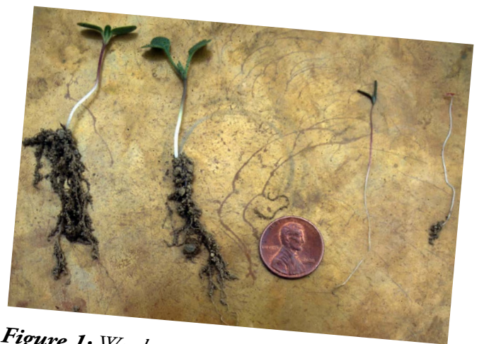
Figure 1: Weeds are most vulnerable when they are in the 'white thread' growth stage, shown at right. The larger weeds at left have a higher chance of re-rooting after cultivation.

cultivating. 3 As with cover cropping and crop rotations, timing is extremely important to maximizing cultivation efficacy ( Box 1 ). To learn more, check out the Physical Weed Control bulletin in this series.