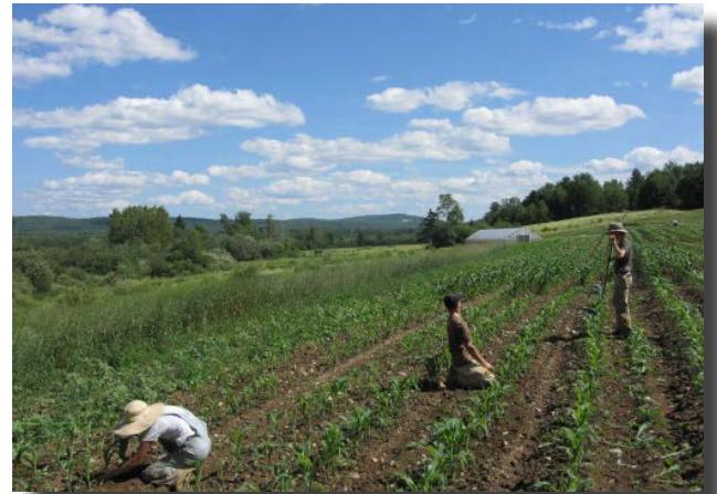
Hand weeding organic sweet corn

O rganic farmers use a wide range of integrated strategies to manage weeds without synthetic herbicides. Successful weed management often goes beyond protecting crop yields within a single growing season. The beginning farmer may find these tips and tricks helpful in choosing strategies that will contribute to effective weed management, both seasonally and long-term.