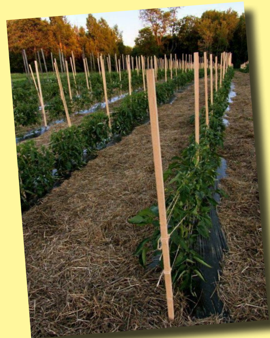
Tomatoes and peppers planted in black plastic mulch, with straw mulch in the pathways.