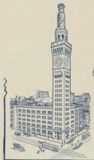
BROMO-SELTZER TOWER BUILDING, BALTIMORE.