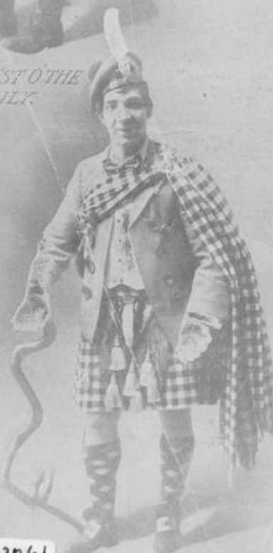
LOVE A LASSIE!