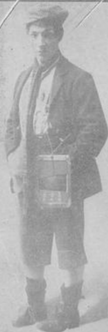
THE SAFFEST O' THE FAMILY