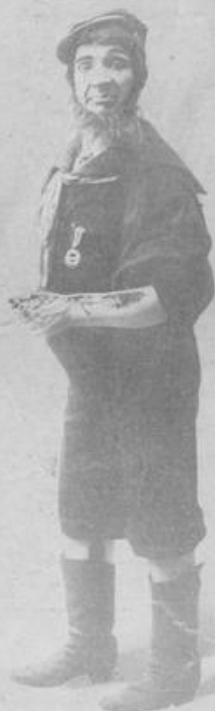
WE PARTED ON THE SHORE.