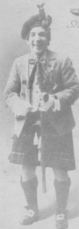
STOP YER TICKLING.