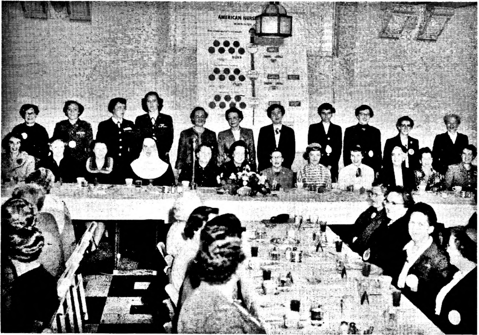
LUNCHEON—BALLROOM OF THE NORTHLAND HOTEL, MAINE STATE NURSES' ASSOCIATION, OCTOBER 8, 1954