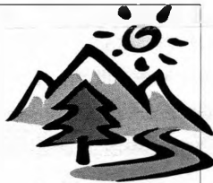
13TH ANNUAL RACE TO END DOMESTIC ABUSE

Womancare's 13 th Annual Race to End Domestic Abuse on Saturday, October 3rd at the Piscataquis Community Middle School in Guilford is the kick-off event to mark Domestic Violence Awareness Month. The Race and Walk offer fun opportunities for the whole family. All are invited to take the leisurely walk or compete in the 5 K runs along the river and enjoy the fall foliage in downtown Guilford. For those who do not wish to run or walk, a delicious Community Breakfast will be offered from 8:00-11:00 a.m. in the middle school cafeteria.