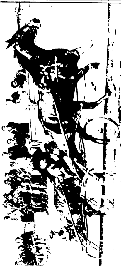
— Little Maggie wins —