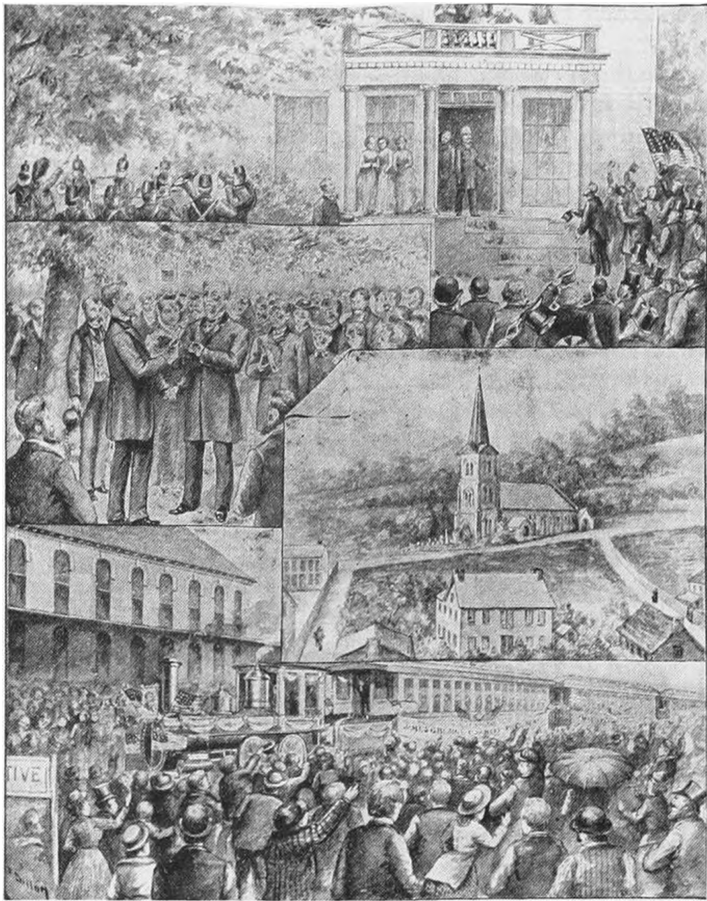
Scenes from James G. Blaine's career. A composite illustration from John Clark Ridpath's Life and Works of James G. Blaine (1893).

to others, the "Continental Liar from the State of Maine." Blaine's personality was a quality that inspired either intense loyalty or absolute disgust.