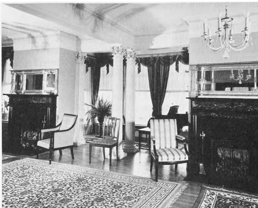
Scenes in the Blaine house demonstrated the melding of public and private life that seems so characteristic of Blaine's career. Official visitors, family, and friends mixed in an exciting but hectic campaign summer atmosphere.

and that one quart of oysters will satisfy only five?