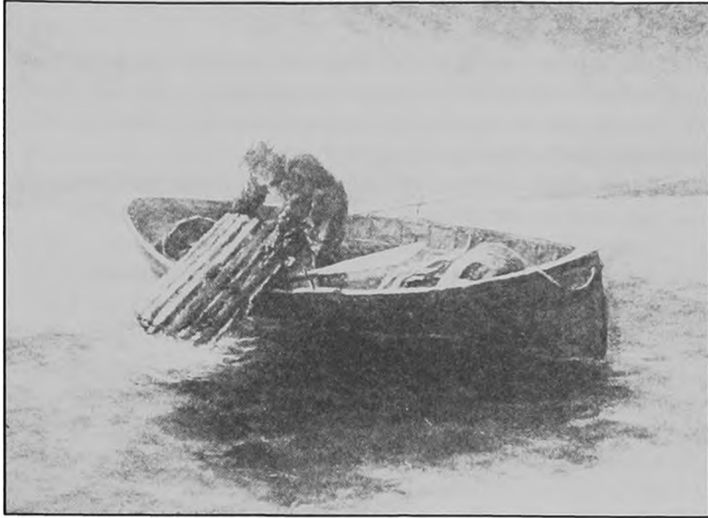
Occupational individualism proved no insurmountable barrier to union organizing among Vinalhaven lobster fishermen. Scribners Magazine (1909).

water called for a rope over fifty fathoms long. Gone were the days when one could find lobsters under the rocks with a gaff. 10