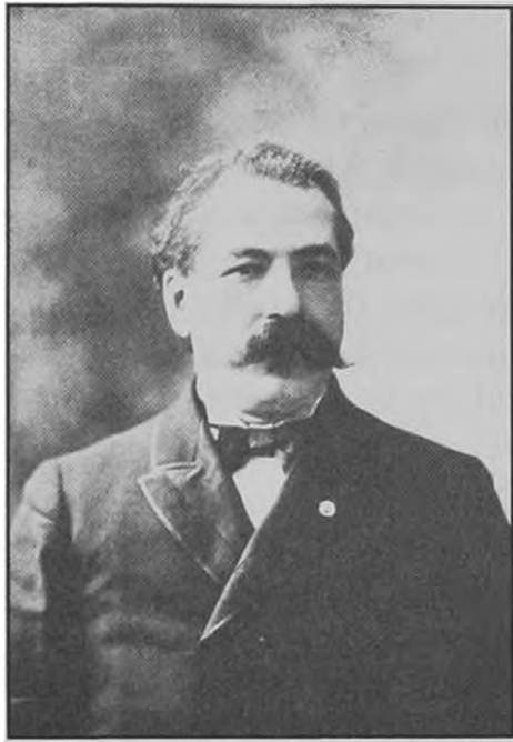
A.F. of L. President Samuel Gompers, no doubt intrigued by the novelty of organizing lobster fishermen, visited Vinalhaven in 1907. There, he encouraged the lobster fishermen in their endeavors and helped himself to several portions of the product of their toil. Gompers, Seventy Years of Life and Labor (1925).

had taken place regarding the formation of an international union. 40 On January 22, 1907, Vinalhaven officials finally received the communication they had been waiting for. President Gompers directed his secretary to send an application form for a charter to the lobster fishermen. 41 He informed the officers of the State Federation of Labor of his actions and of the encouragement he had given the local movement in Maine: