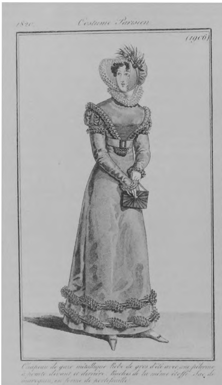
FIGURE 13. "Costume Parisien" from Journal des dames et des modes , 1820. Private collection