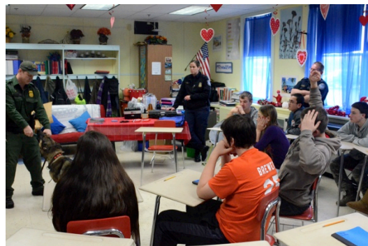
Photo caption: Lubec 8th grade students, Cash for Careers Program guest speakers Custom and Border Protection Officers and K-9 companion.