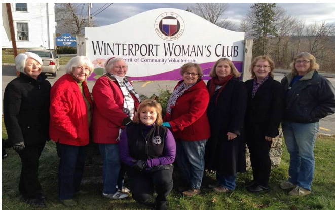
GFWC Winterport Woman's Club