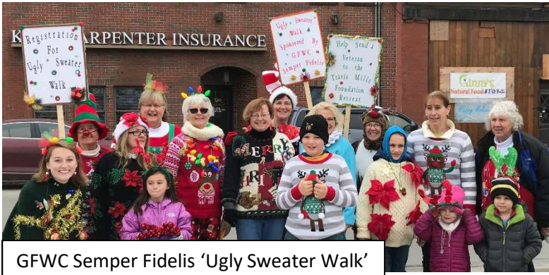
GFWC Semper Fidelis 'Ugly Sweater Walk'