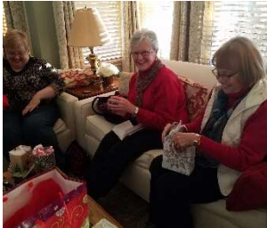
GFWC Newport Woman's Club Christmas Celebration