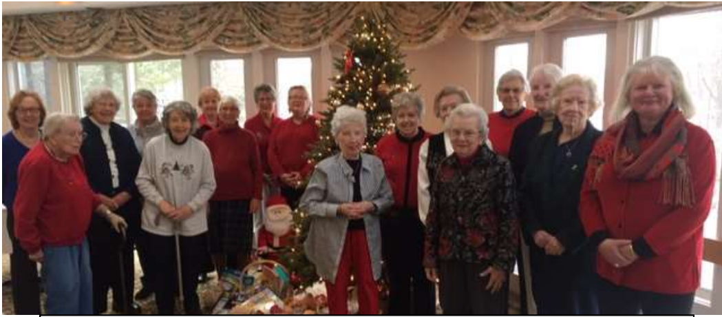
Waldoboro Woman's Club Annual Christmas Luncheon