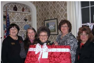
The Mid Coast Area Chapter of the International Association of Administrative Professionals (MCAC IAAP) presents the Cosmopolitan Club of Bath with a check for $300 in support of the Club's capital campaign.