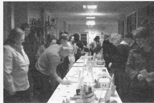
Silent Auction: the bidding heats up

People needing a break from sampling desserts, chocolate and otherwise, were able to bid on items ranging from handmade quilted bags to a