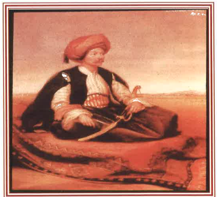
Sir Gardner Wilkinson, founder of Egyptology in Britain