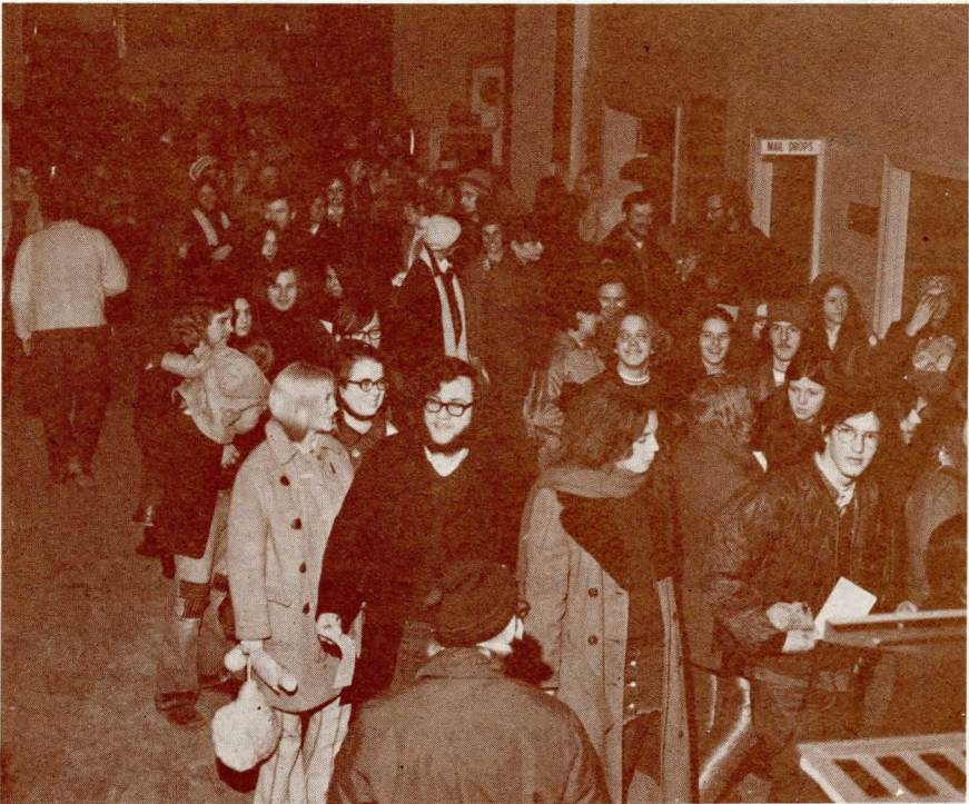
first registration, february 3, 1971

although last summer the number of courses and students decreased, when students returned this past fall, abenaki grew in courses and people once again. we have also been working on foundation grants, for there are many things we would like to offer which require financial backing. we are constantly growing, changing, making mistakes, and hopefully learning from our mistakes. we feel that abenaki can help to build a better community to live in, but we need your help. we need people to teach, people to take courses, and any other support you can give.