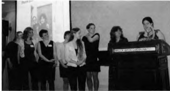
UMaine's Student Women's Association receiving this year's Mabel's Torch Award.

Continuing to combine education, advocacy and clinical services At Mabel Wadsworth Center, we know we can best serve women by blending our clinical, educational, and advocacy services. A recent activity within the Center that continues to provide such blending is the cross-training of staff. Our education and outreach coordinator is now trained to educate women about pregnancy options, birth control options and abortion care. Likewise, members of our clinical staff worked together with administrative staff to create the Gaining Access Project (GAP), designed for uninsured clients. Check out our website for more information on GAP.