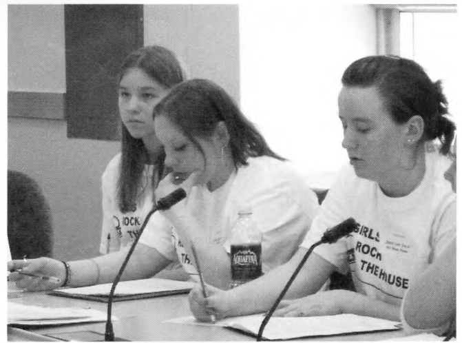
Girls' Day participants hone their legislative skills during a mock public hearing

The students also received a Girls' Day Action Guide, met with legislative leaders, job-shadowed their legislators, participated in a mock press conference and a mock public hearing, and nearly a third of them served as pages in the House and Senate. From one teacher's perspective: "Lives can be changed by events such as this, and this is not the first time Girls' Day at the State House has invigorated my students to see themselves as powerful women." From one student's perspective: "I learned that everyone's voice is important. Also, I can make a difference."