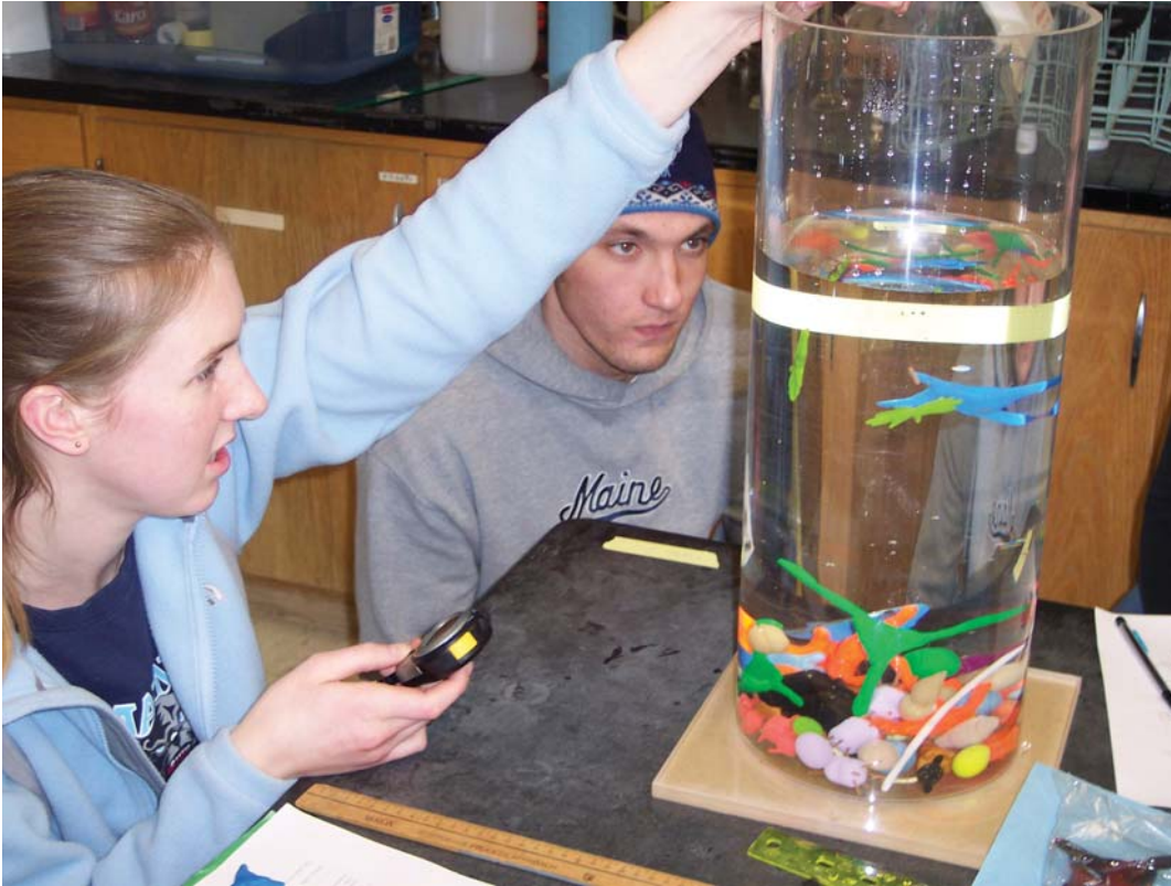
Figure 3. Measuring the sinking speed of clay models of plankton.