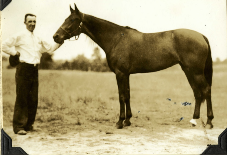
— Glance —