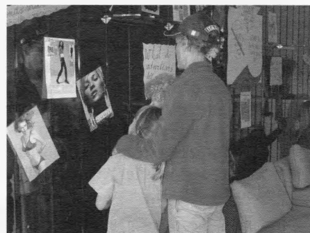
Right: Enjoying the open house.

All films will be shown at Railroad Square Cinema in Waterville from 10 – noon. Admission is $5.