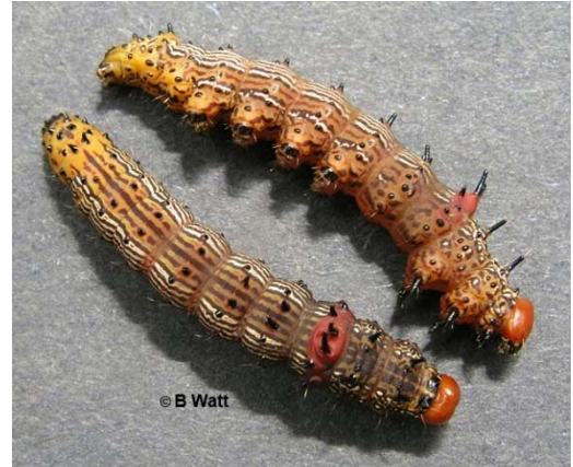
Redhumped caterpillars.