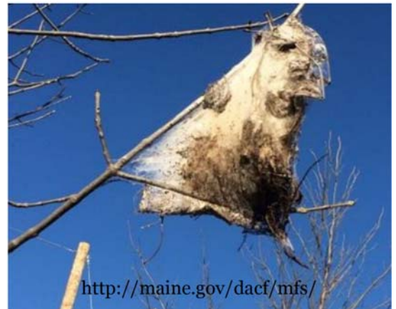
Old fall webworm nest. Maine For. Serv. http://maine.gov/dacf/mfs/