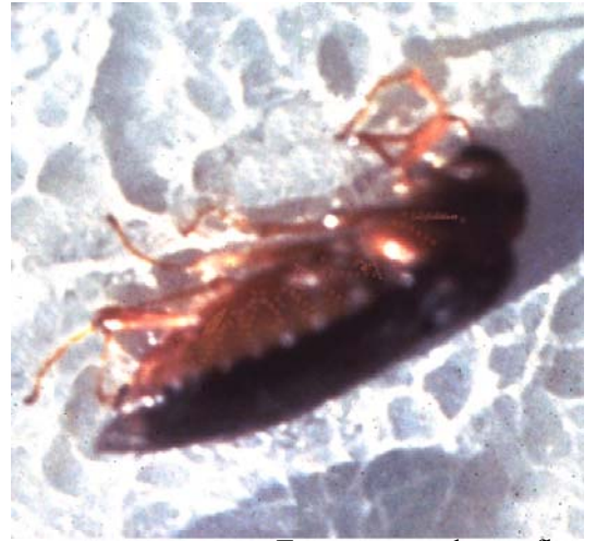
European apple sawfly.

Plum curculio is the most threatening apple pest in the weeks following Petal Fall. With high population and warm wet weather, plum curculio can damage upwards of 80% of apples. However, the females hold off on laying eggs, for the most part, until fruit are about 8mm diameter (~ 1/3 inch). If you do not need timely insecticide right after Petal Fall for EAS, then the first Plum curculio spray can wait until fruit begin to size.