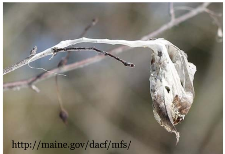
http://maine.gov/dacf/mfs/ Overwintered nest of browntail moth larvae. Maine. For. Serv.