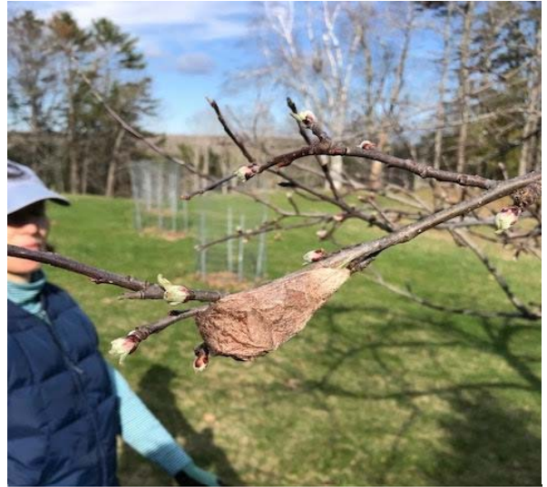
Fall webworm nest left from last year.