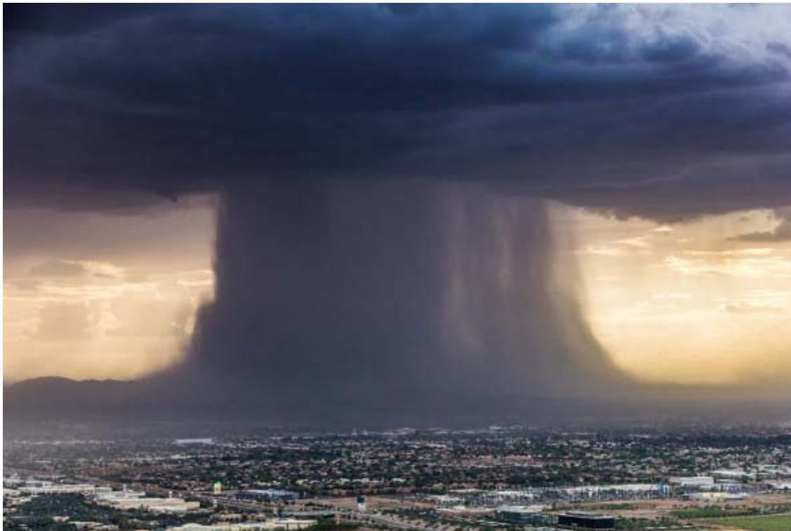
Rain cloud over Phoenix AZ in 2016.