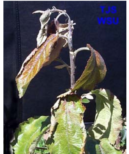
Early stage of fire blight infection.

Once in the orchard, rapid sanitation is required to keep it from spreading. That requires frequent checking and rapid response. But we are not there yet. Apple scab is the priority right now.