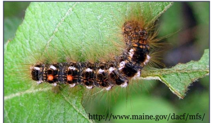
http://www.maine.gov/dacf/mfs/ Browntail moth larva. Maine. For. Serv.

• Gypsy moth caterpillars have pairs of blue and red spots along their back and are covered with long brown hairs. (Gypsy moth caterpillars have hatched this week. Small larvae may blow into orchards.)