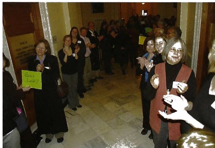
At the beginning of the 124th session, the Maine Women's Lobby, along with our many partners in the 'Maine Can Do Better' coalition, welcomed legislators and thanked them for their service to Maine people.