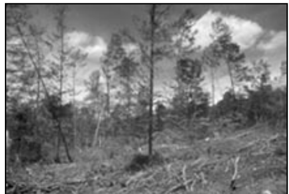
FIGURE 11.—Rehabilitation treatments must leave the best of the residual trees, often at a wide spacing.

Diameter-limit cutting fails as a long-term strategy for sustainable forestry. It neither improves the quality and value of trees in a stand nor controls the stocking for optimum long-term production of sawtimber and for other values. Diameter-limit cutting does not provide consistency in long-term yields, nor does it deliberately enhance hydrologic or other ecologic conditions. Further, the appearance of diameter-limit stands may detract from recreational potential. In short, diameter-limit cutting shows little regard for the future and does not optimize long-term values for a landowner.