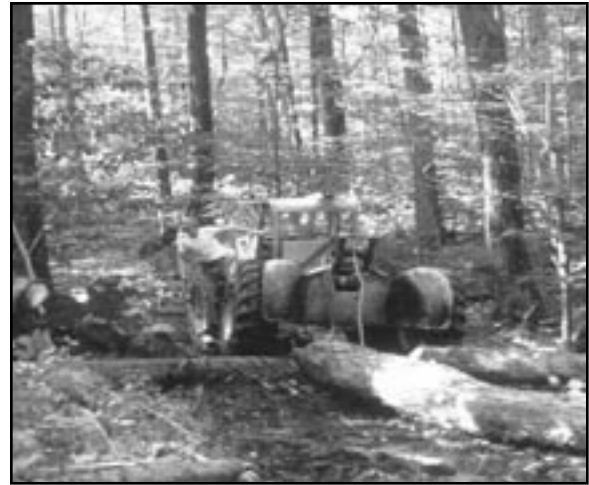
FIGURE 2.—Timber harvesting gives landowners the opportunity to alter the condition and density of their forest to serve a variety of objectives and generate revenue in the process.

new ones at appropriate times. And because trees of good form and marketable species have value for a host of products that people depend on for daily living, landowners can sell excess and mature trees to generate revenue and pay off their investments in ownership and management (figure 2).