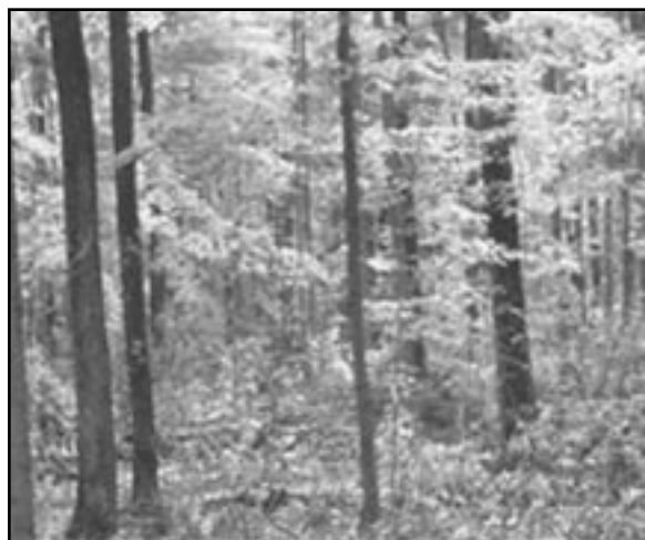
FIGURE 6.—Differences in quality and stocking among residual trees after diameter-limit cutting (top) and thinning in even-aged stands.

thinning frees crowns of the best trees and controls the density and spacing of the residuals. It exposes their crowns to more sunlight but maintains sufficient numbers for utilization of site resources and acceptable levels of future volume growth. In the long run, thinning can increase the volume yields from an even-aged stand as well as long-term income for the landowner.