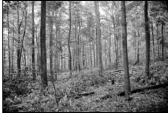
FIGURE 9.—A 70-year-old, even-aged northern hardwood stand will support operational thinning that regulates spacing and density, and concentrates the growth on high-quality dominant and codominant trees.

Recently summarized data show that repeated diameter-limit cutting left the stands with fewer large trees, less sawtimber volume and growth, and one-half as much regeneration as selection cutting (Kenefic and others 2005). In fact, diameter-limit cut stands had virtually no medium to large sawtimber after the first entry, while the amount of sawtimber increased steadily in the selection stands (figure 10). After