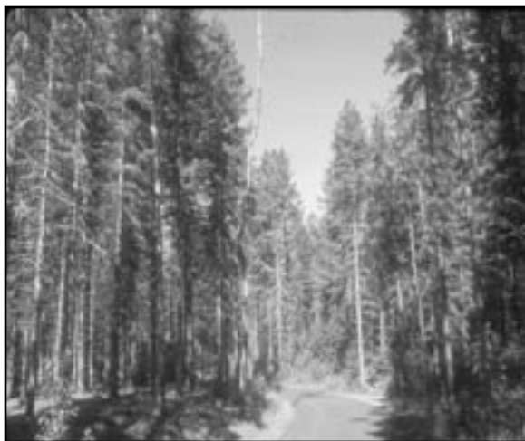
FIGURE 3.—Northern conifer stands after a diameter-limit cut (top) and following a silvicultural treatment.

although decayed trees are common in diameter-limit cut stands and are important components of wildlife habitat, the lack of a specific residual structure makes it difficult to predict outcomes for wildlife. Diameter-limit cutting simply removes the biggest trees, liquidating timber assets and trading long-term production potential and other values for immediate financial gain.