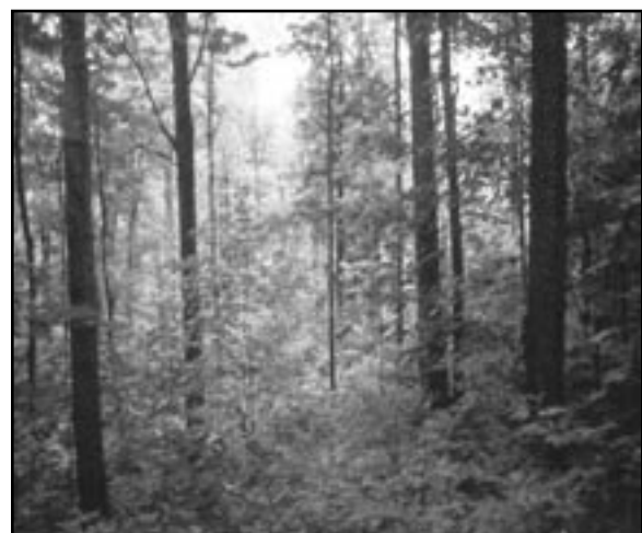
FIGURE 7.—Post-cut conditions in diameter-limit (top) and selection-system stands.