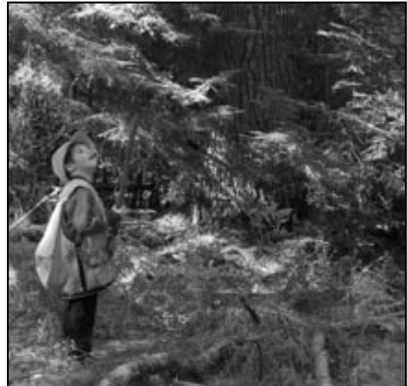
FIGURE 12.—Landowners' values vary, but often include protecting the forest for future generations.

Any of these strategies would give landowners a viable alternative to diameter-limit cutting while providing income in the short term. The best choice depends on the landowner's interests and the condition of the stand (figure 12). Good planning usually will uncover a strategy that avoids the long-term pitfalls of diameter-limit cutting, while still providing many landowner benefits. Deliberate efforts are needed to monitor conditions in the forest, maintain appropriate levels of stocking, enhance the growth and vigor of desirable species, and regenerate new trees and new forests when the current ones mature or no longer serve the landowner's needs.