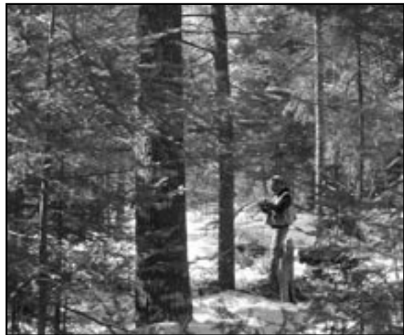
FIGURE 4.—Examples of even-aged (top) and uneven aged northern conifer stands.