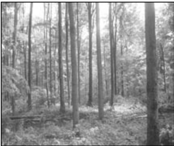
FIGURE 1.—A managed northern hardwood stand.

These goals are realized through silviculture, which includes several methods that tend the trees growing on a site and regenerate