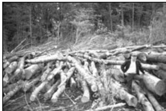
FIGURE 8.—A first diameter-limit cut often removes the best trees and high-value species (left), leaving only smaller, poor-quality trees for future harvests.