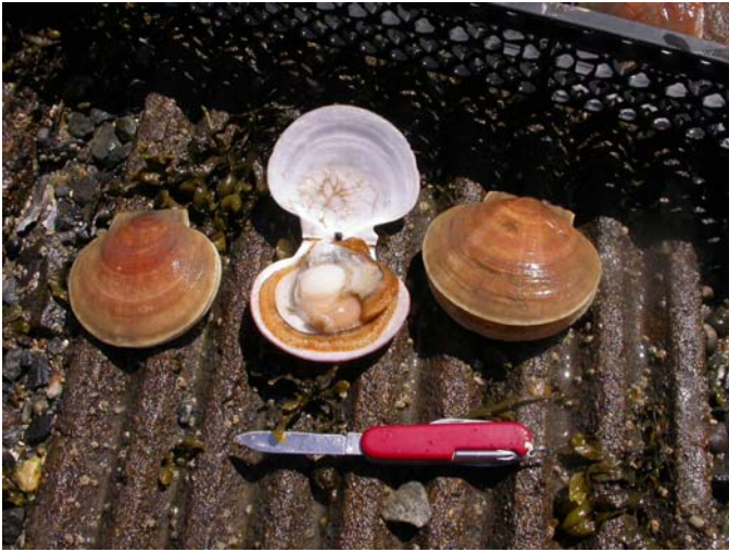
Sea scallops ( Placopecten magellanicus ) raised at the Darling Marine Center in Walpole, Maine, for education and demonstration. Shucked individual is female; note the orange roe sac. Scallops are not fully developed as an aquaculture species in Maine, although the wild fishery uses aquaculture techniques such as spat collection for wild stock enhancement.

issues and solutions, collaborating with regional partners on the biannual Northeast Aquaculture Conference and Exposition (NACE), convening forums where industry and concerned citizens can work on issues of concern, organizing visits to aquaculture sites and facilities, and various speaking engagements. ME SG also produces publications relevant to the aquaculture industry.