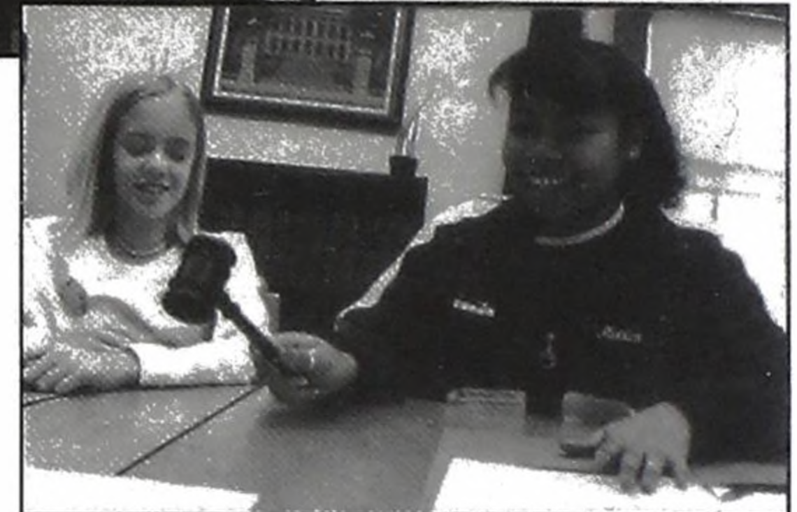
Right: Participants take part in a mock hearing in an effort to understand how the Legislative process works.

ence of how the legislative process works will inspire the girls to set their sights high and accomplish great things. As one of the girls wrote on her evaluation at the end of the day, "I learned about being a page, how it is to participate in a mock public hearing, and how the Representatives and Senators do their work." Another wrote, "I learned that no matter what your goal is, you can do it!"