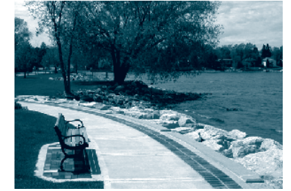
Scenic water vistas, tree-lined streets, inviting bike paths, parks and green spaces encourage all ages to experience the many year round activities that draw people to Sturgeon Bay, Wisconsin. The waterfront experience is enhanced by public access, shoreline walkways, marinas, informational plaques, observation points, and self-guided tours.

SMART GROWTH approaches provide one possible tool for communities seeking to balance economic benefit with environmental protection. In cities and older suburbs, smart growth approaches invest time, attention, and resources in restoring community and vitality. New development is generally more town-centered, transit- and pedestrian-oriented, and has a greater mix of homes, offices, shops, and other uses. Open space is preserved or enhanced. Smart growth principles were developed in 1996 by the Smart Growth Network, which is a group of private, public, and non-governmental organizations working together to improve the quality of development in neighborhoods, communities, and regions across the United States. These principles help guide growth and development in communities that have a vision of what they want their future to be and of what they value in their community; however, the principles do not directly address coastal and waterfront communities. Coastal smart growth elements were drafted by a collaborative team from EPA, NOAA, and the U.S. Department of Agriculture.