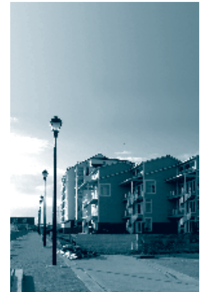
A boardwalk between a private condominium development and the shore ensures continuous public access; a brick planter separates public and private spaces, while permitting clear views of, and from, ground floor units.

These changes are driven by changing coastal real estate markets. Not only does affordable housing become an issue as land/property values rise, but affordable land for ANY kind of coastal dependent activity is similarly constrained.