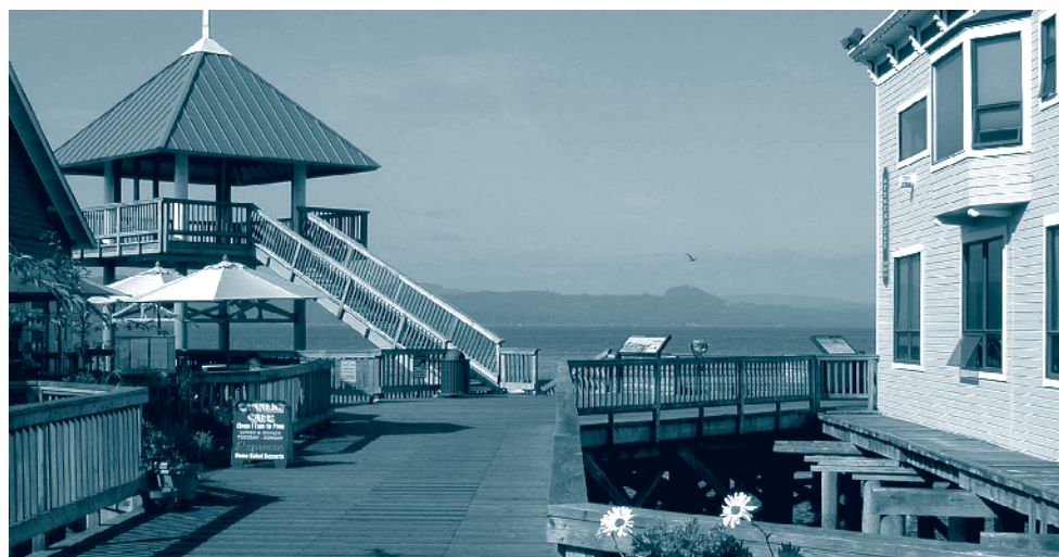
In Astoria, Oregon, a viewing tower and interpretive signs provide visitors with views of the Columbia River Estuary and glimpses of Native American historical occupancy of the area.

The waterfront can be an economic advantage for a community, as people and businesses are attracted to land near or adjacent to the water. Yet waterfronts present unique challenges. Not all land adjacent to the water can be developed, and much of the shoreline may provide critical ecological functions and thus is subject to building restrictions.