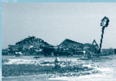
Aftermath in Biloxi