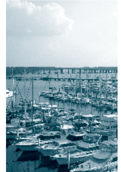
Marina in New Bern, North Carolina

The goal of this report is to highlight the national extent of coastal access conflicts and present solutions, rather than specifically analyze the environmental impacts of coastal access. However, many survey respondents see environmental effects as integral to the conversation about access. In their view, it could be said that we are loving our coast to death, as wildlife and their habitats will experience the ramifications of taking no action to address coastal access conflicts in the United States.