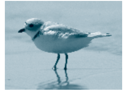
Piping Plover

State governments are a central player in how access is managed at the town, county, and statewide level. Several states have passed laws declaring public rights to access the shore (examples on pages 24 and 25 include Texas, California, and Washington). As an alternative, state legislatures can pass laws that address what uses are compatible with the goals of waterfront management, such as Florida's recent Working Waterfront Legislation.