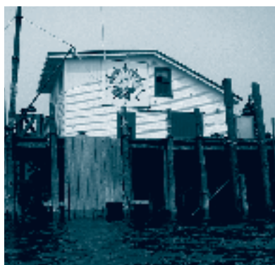
Maine's working waterfront

From island fishing villages to bustling urban seaports, the loss of working waterfront is felt throughout entire communities where fishing is a major contributor to the economy. The cause of this decline is influenced by multiple factors, including dwindling fish stocks (real or perceived), restrictions and regulations, high fuel prices, and global competition. Communities that wish to maintain their culture and values are faced with difficult choices when increasing property values could displace longtime residents and family businesses. As prices and taxes soar in developed areas, people look further afield and move to previously overlooked areas where real estate is still relatively affordable. In this sense, coastal fishing communities are facing similar challenges as traditional working landscapes everywhere, such as the rangelands of the western U.S., the family farm, and logging towns on the fringe of our nation's forestlands.