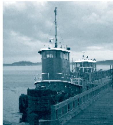
Eastport, Maine