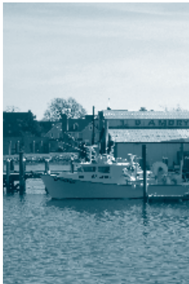
Amory’s Seafood has operated on the Hampton, Virginia, waterfront for over 80 years. Once a hub for commercial fishing and seafood processors, Amory’s is one of the last vestiges of the former Hampton industry.

In the coastal zone, land use is water use. Upland development decisions impact not only water quality, but also the amount and quality of water access sites available for myriad uses. Residents often assume that their community’s zoning regulations will protect them from inappropriate development. A graphical representation of development of all buildable land under current zoning, and how the development pattern influences water quality and access, can help citizens understand the implications of existing policy. This “build-out analysis” allows the community to glimpse its future if all land is developed to the maximum extent allowed under current regulations. Utilizing a matching grant from EPA’s Smart Growth Program, Virginia Sea Grant initiated the completion of a Geographic Information System (GIS) build-out analysis for Lancaster County, Virginia. The project, “Developing a Vision for Land Use and Waterfront Access in Lancaster County,” produced a graphic representation of what Lancaster County would look like if all parcels of land were developed as currently zoned, informing the upcoming dialogue concerning revisions of the county’s Comprehensive Plan.