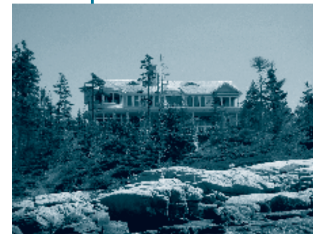
Maine coastal home.

The foundation of nearly any planning for waterfront access starts with an inventory of existing access and ownership patterns.