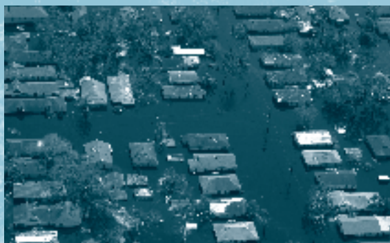
Views of inundated areas in New Orleans following breaking of the levees surrounding the city as the result of Hurricane Katrina.

The landscape was characterized by foundations, slabs, piles of debris, and houses that floated from their foundations.