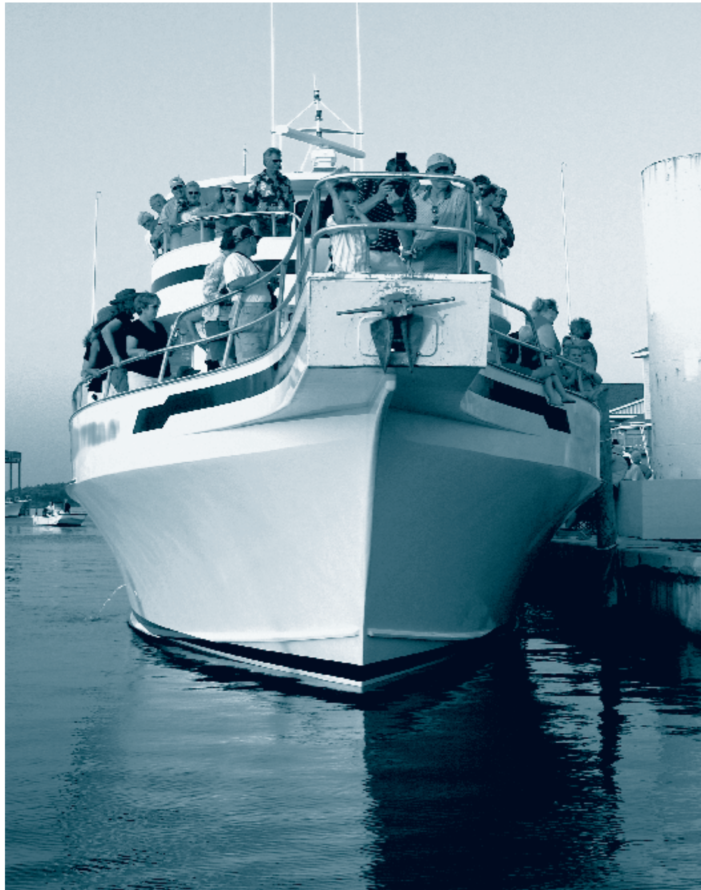
In coastal North Carolina, working waterfronts include docks for large "head boats" that offer fishing trips & other excursions.

A 1998 assessment of state CZM Section 309 programs by Rhode Island Sea Grant found that coastal states have given significant attention to access issues. The report also found that, as funding to purchase coastal property has dramatically decreased, emphasis has shifted to technical assistance and public outreach. In their report, Rhode Island Sea Grant recommended that the types of tools and programs used to acquire public access be documented, and that a stronger effort by NOAA to communicate specific public access success of state Coastal Zone Management programs was needed. Hopefully, the solutions described in this section will fulfill, in part, Rhode Island's recommendation.