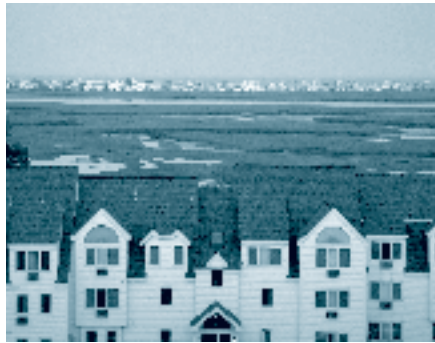
Changing landscape in Wells, Maine

On the Atlantic coast of Maryland and Delaware, the availability of access has not changed, there are simply more people visiting the beach every year. Most of the Chesapeake Bay and its tributaries are lined by privately owned lands with no public access. “Everyone wants free or low-cost public access until it is in their backyard. There is a fear of too much activity, trash, and any ‘riff-raff’ that might come with access, particularly launching sites.” — environmental planner from Maryland