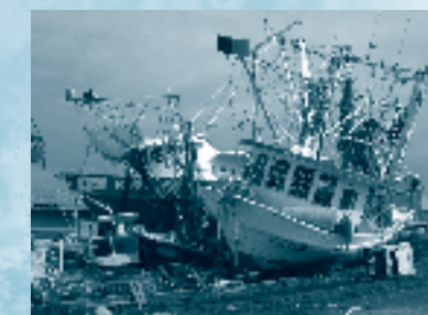
Stranded boats