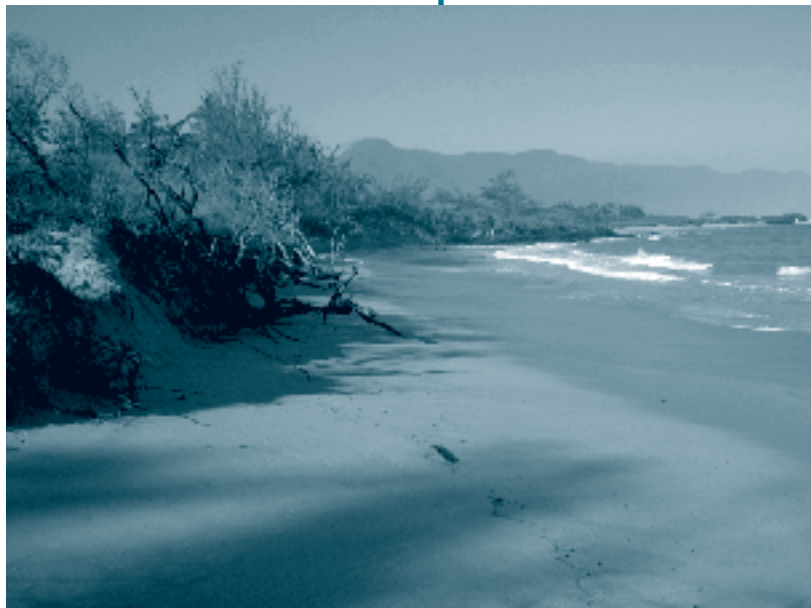
A conservation easement now protects this waterfront area with a 400-foot setback

CONSERVATION EASEMENTS , a traditional land conservation tool, can also be used to protect working waterfront properties. In Maine, the York Land Trust partnered with lobstermen to purchase and protect a traditional fishing dock and adjacent plot of land. The land trust holds a conservation easement protecting the scenic view and water quality, and the lobstermen own and operate the dock and property for commercial fishing. Similar partnerships are being encouraged through a state bond program for protecting waterfront used for commercial fishing activities (see Case Study: ▼). Proposed federal legislation, the Working Waterfront Preservation Act, was reintroduced on March 1, 2007 (at the time of this writing, the bill was under consideration by the Senate Finance Committee).