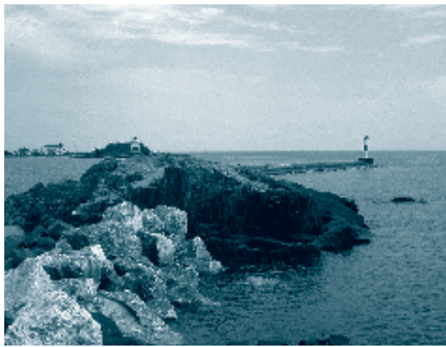
On the shore of Lake Superior in Grand Marais, Minnesota

LAND TRUSTS sometimes work with communities to protect waterfronts. One particularly successful example is from Grand Marais, Minnesota, where much of the harbor and shoreline were protected from development by land trusts. The land is now maintained as parks, a municipal campground, the harbor itself, and other uses open to the public. In Hawaii, the Maui Coastal Land Trust has been very successful in acquiring conservation easements on critical coastal parcels (see Case Study: ▼), and a Maui developer who planned 52 residences on a coastal parcel redesigned his project to better accommodate the community's vision of preserving coastal access. After the public outcry in response to his original design, as well as through education provided by University of Hawaii Sea