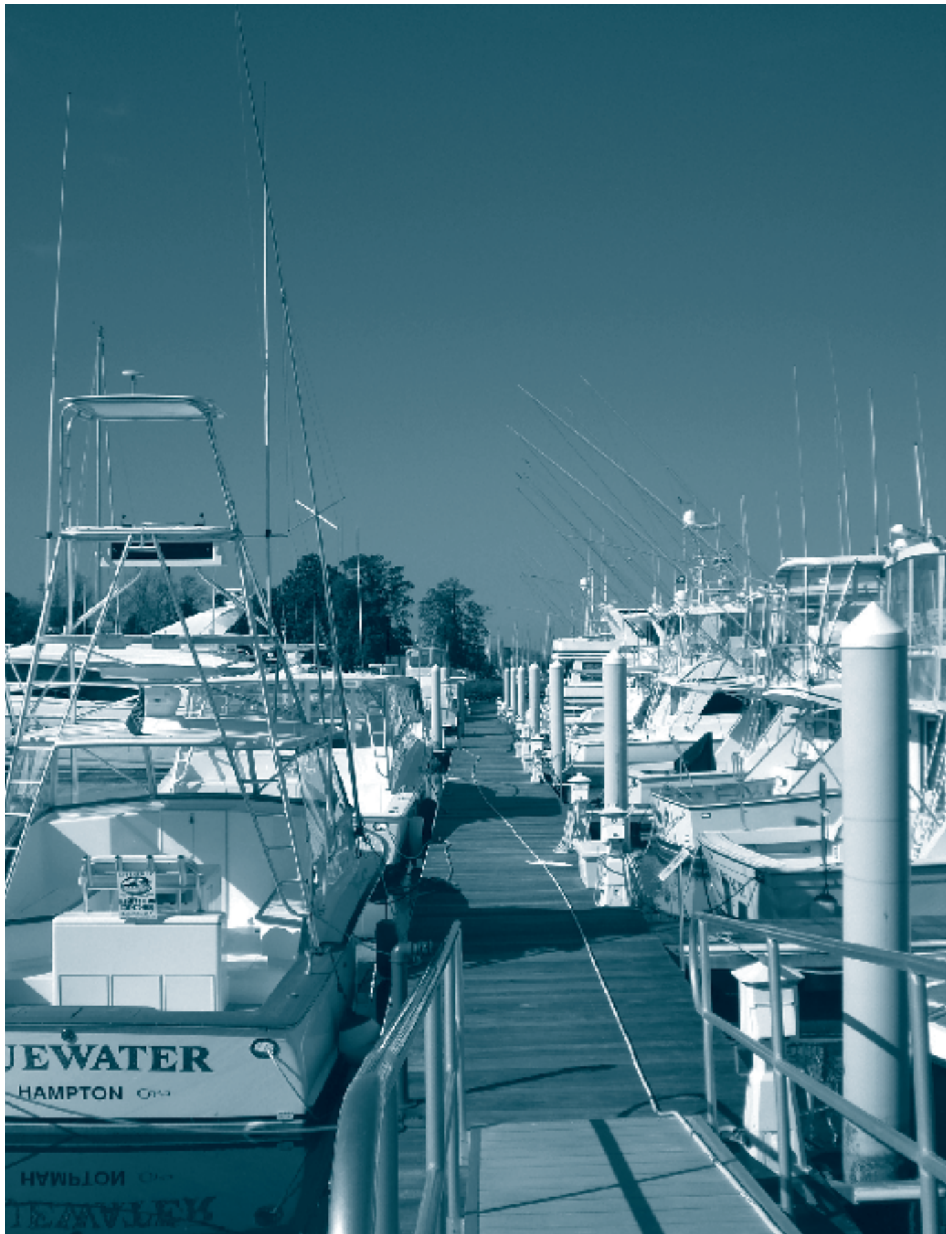
Recreational boats line docks that once housed commercial boats.