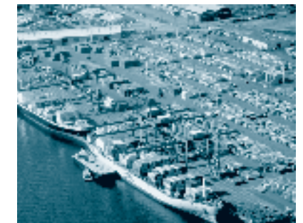
Seattle, Washington