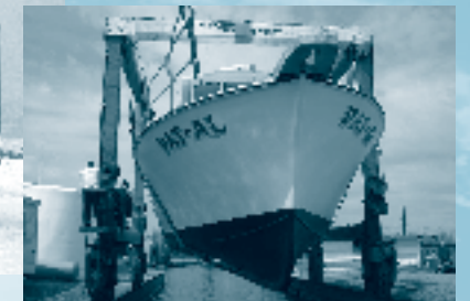
Boat going into water.

Because storm surges destroyed launching equipment, even seaworthy boats could not be placed in the water. The Port and Town of Valdez, Alaska, donated a surplus 60-ton Marine Travelift to Plaquemines Parish, Louisiana. Louisiana Sea Grant worked in conjunction with the Washington and Alaska Sea Grant programs, the Pacific Coast Congress of Harbormasters, and the Port of Valdez, Alaska, and others to transport the equipment from Alaska to Louisiana, where it is now helping the fishing industry get back to work.