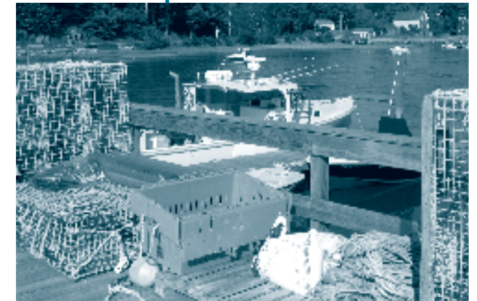
Pier in York, Maine

Only 25 miles of Maine's 5,000-mile coastline are currently still available for working waterfront use, and much of this area is in private hands and vulnerable to real estate market trends. The Maine Working Waterfront Coalition, made up of more than 100 organizations and individuals, mounted a well-publicized campaign to address the issue. As a result, a widely supported state referendum was passed in 2005 to allocate $2 million of bond funds towards the protection of working waterfront lands. The bond, Land for Maine's Future, had historically required public access in its funded projects but did not specifically address working waterfronts. The funding assists both municipal governments and/or private efforts in meeting the sale value of working waterfront properties. It also retains a working waterfront covenant on the land, which ensures the parcel remain a working waterfront property in perpetuity. Of the 100 or so inquiries in 2006, the program was able to fund the protection of six properties dedicated to commercial fisheries access. Though the number of initially funded projects is small, there is widespread interest and support for extending the program.