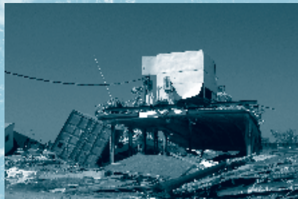
Ice plant necessary to preserve commercial fish caught in Plaquemines Parish.

As a result of hurricanes Katrina and Rita, all of the ice plants were destroyed, eliminating the ice-making and storage capacity in the coastal zone. Shell Oil Company, a significant oil and gas producer in Louisiana and throughout the Gulf of Mexico, donated $500,000 for purchase, delivery, and installation of three industrial ice machines that could produce 20 tons of ice daily. Louisiana Sea Grant worked with Shell Oil Company, the Louisiana Seafood Promotion and Marketing Board, and the Louisiana Department of Wildlife and Fisheries to find locations and operators for the ice-making machines. The first ice machine was producing ice just under a year after the hurricanes.