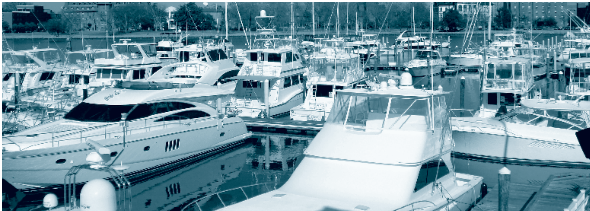
Once a hub of commercial fishing, the city of Hampton, Virginia, now hosts many pleasure craft and recreational boats.

Loss of public access and conflicts over waterfront uses and activities could be viewed as the natural result of population growth in the coastal zone, which is now home to approximately 153 million people—more than half the U.S. population.