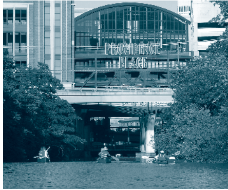
Canoes under Providence Place Mall