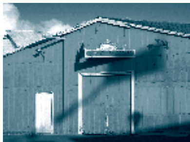
Due to soaring land values, many former fish markets, such as this one in Morehead City, North Carolina, are being replaced by new waterfront developments. Thus, the North Carolina Waterfront Access Study Committee explored options to support working waterfronts and other public access projects.