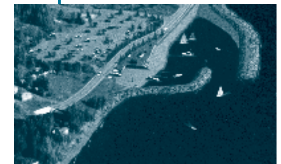
Artist’s rendering—McQuade Public Access. Minnesota Department of Natural Resources