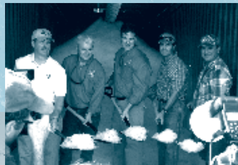
With a donation from Shell Oil Co., an ice house was installed at the Port of Cameron. The ice houses previously at the port were destroyed by Hurricane Rita in September 2005.