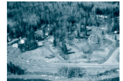
Lake Superior coast. MDRNR Trails and Waterways