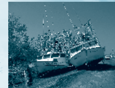
Over 4,000 commercial vessels in the area were destroyed, damaged, and or washed on shore.