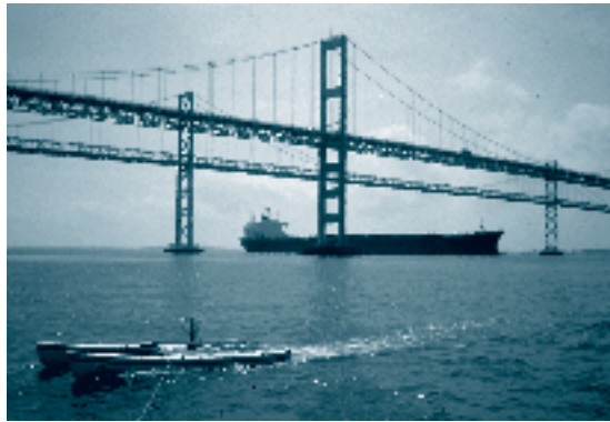
Chesapeake Bay Bridge