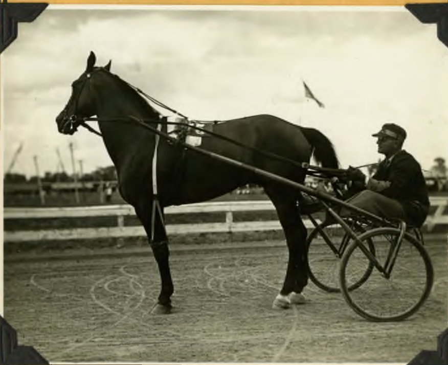
- Northern Knight -