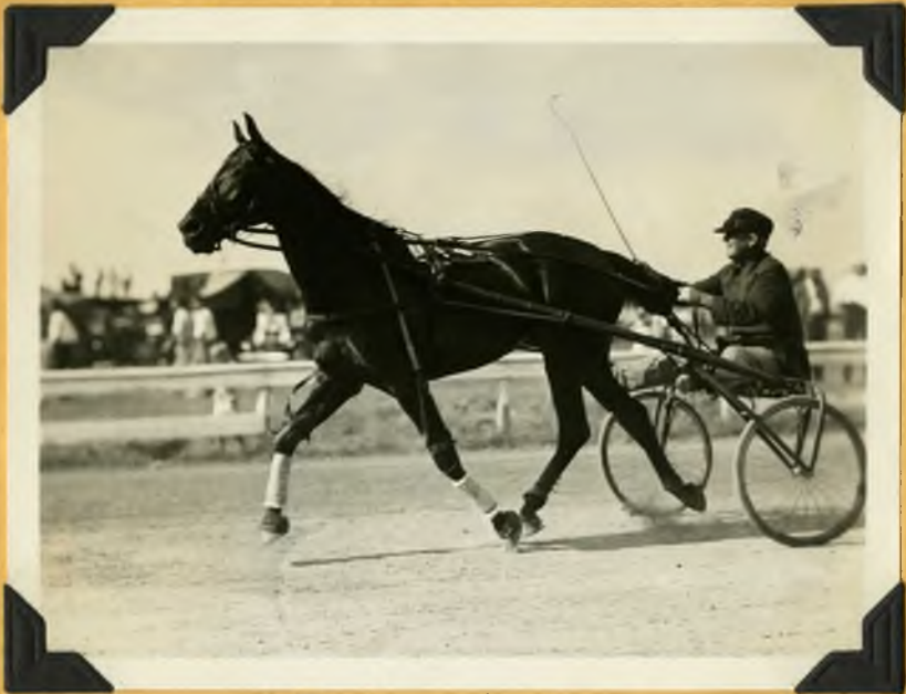
—Primal— Racing, Baseball and Horse Pulling