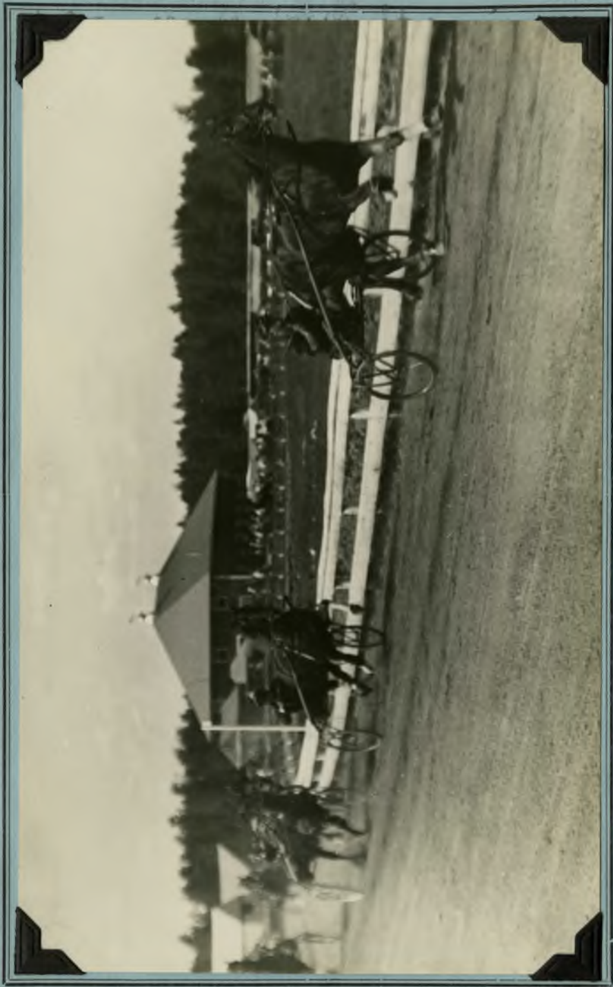
Topworthy wins from Bance