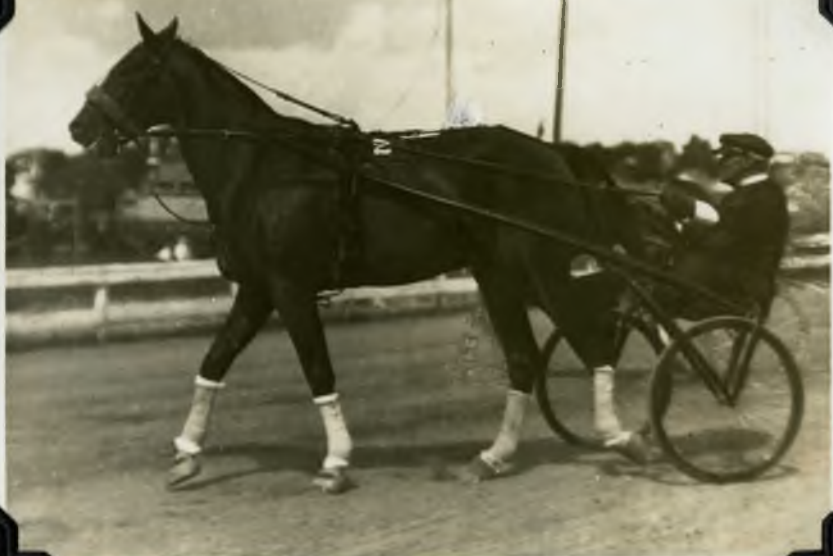
- Stanwood Guy - Fox up