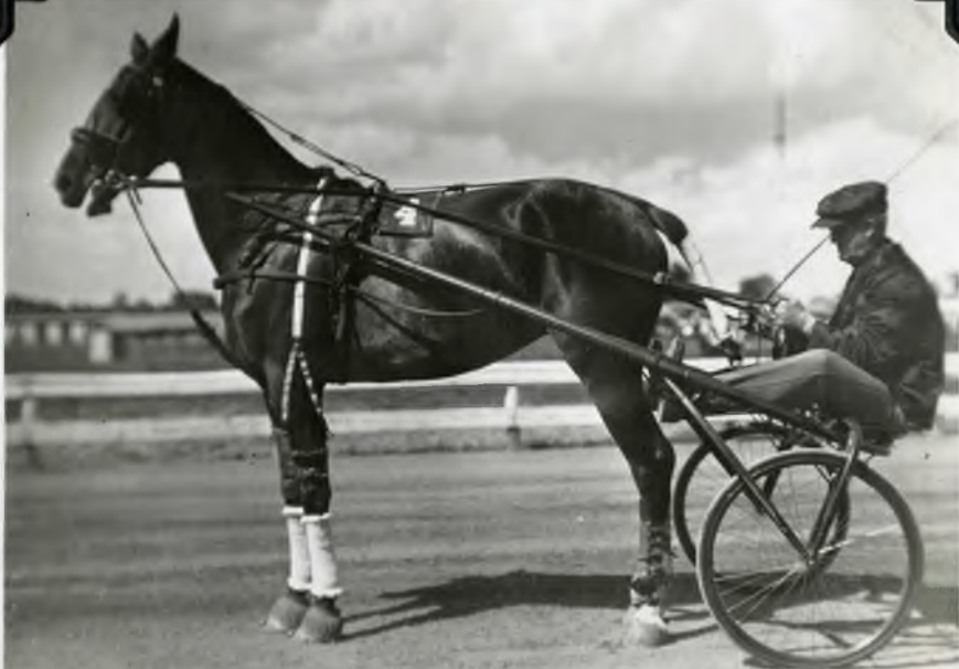
- Cinderella - Kingsley