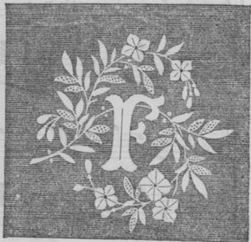
ALPHABET FOR MARKING.

Basque Museum Landing Library Five Hill House Dover 385