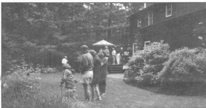
Visitors enjoying a garden in Cumberland