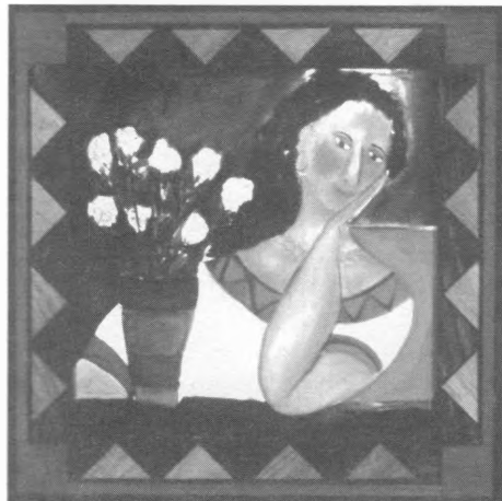
We are proud to feature Nance Parker's "A Painting for Betsy" in the promotional materials for the 2002 Evening to Honor Maine Women and Girls.