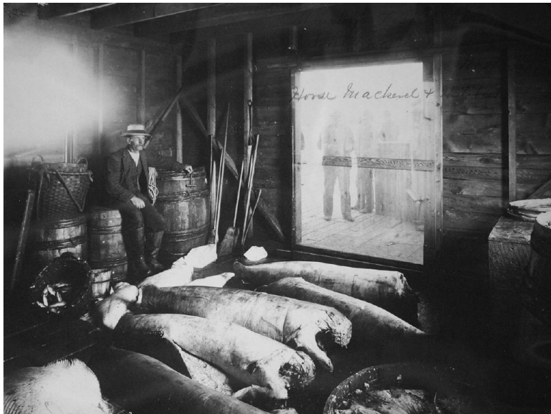
Fish house in Southwest Harbor with swordfish and halibut, 1891.