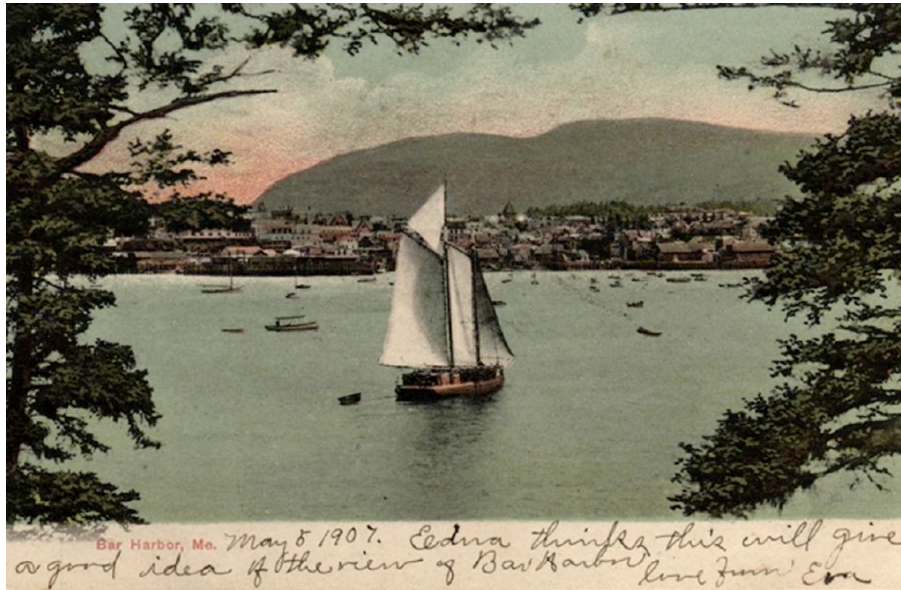
Schooner with deck load of wood entering Bar Harbor, before 1907.