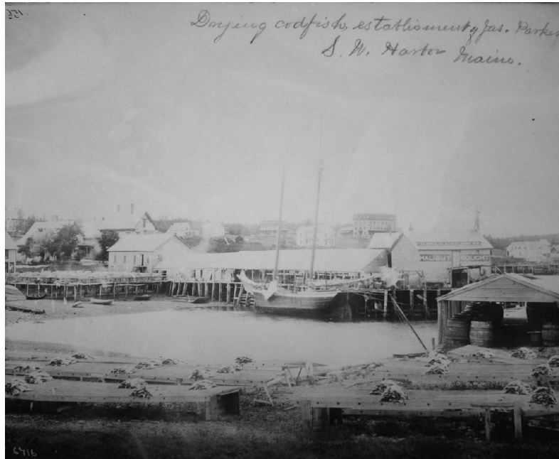
Fish drying on flakes under rain shelters at Parker's Wharf in Southwest Harbor.

fyke nets, and 12,900 lobster traps. Landings included 6,534,125 pounds of cod, over one and a half million pounds each of hake and haddock, over 200,000 pounds of pollock, and 100,000 pounds of cusk. Nearly all of this catch was still salted and dried on flakes—the rest pickled or smoked. Since average vessel displacement was just over 32 tons, most of these vessels and all of the boats were still fishing within sight of Mount Desert Island in what was then called the “shore fishery.” In addition, fishing communities in the Mount Desert Island region produced over 600,000 pounds of pickled mackerel, 500,000 pounds of pickled herring, and 579,000 pounds of smoked herring. They also marketed over 1.6 million pounds of lobster and 151,000 pounds of clams.