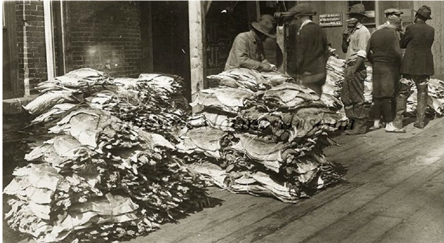
Common sight of dried cod tied up in bundles after drying on fish flakes, likely in Portland.