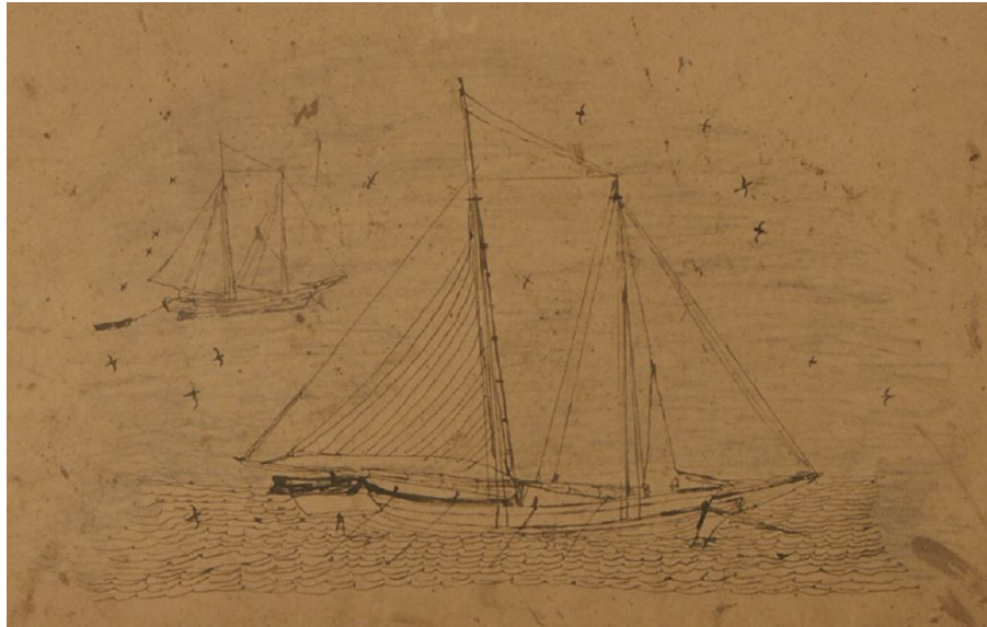
Drawing from the log of the Emeline , William Ward, Master, out of Tremont, 1864. This fine pencil and ink drawing on the back of the logbook shows a typical handling fishing schooner. Four lines extend out from tiny figures along the rail into the water. Birds circling round may have been eating herring or menhaden, and a schooner in the distance, attracted by the activity, will soon arrive to start fishing.

After the Massachusetts cod fishery exhausted once-abundant shore stocks, it moved down the Maine and Nova Scotia shores and toward offshore grounds as far away as the Grand Banks. In contrast, Maine's cod fishery east of Casco Bay remained relatively unchanged from first settlement until after the Civil War, thanks to light fishing pressure, enormous quantities of inshore forage, and ample spawning grounds.