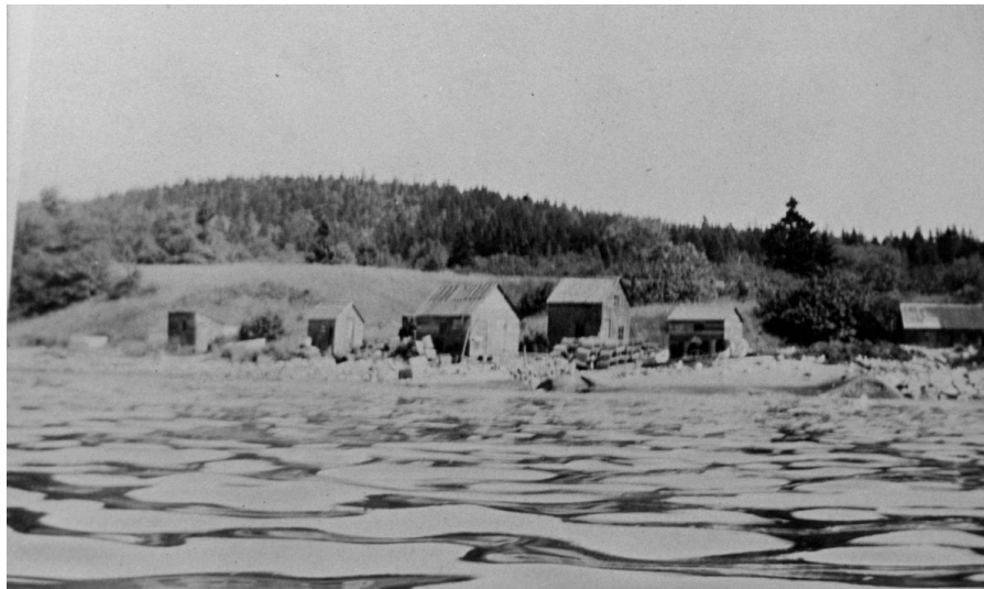
Fish shacks on the east shore of Otter Cove, ca. 1900.

Damon recalls hand lining east of Baker Island and selling the catch at Beals, after the Stanley Fish (be consistent should Fish be in the name above?) Wharf burned down in the 1960s. In that same area, Damon explains, it was not uncommon to catch 500 to 700 pounds in a three-to four-hour period. They would dress (gut) the catch and bring it to Beals for four and a half cents per pound. He recalls one day catching two cod in the 30- to 40-pound range. In the mid 1960s, 15 to 25-pound cod were more the norm but “when you went out handlining, there was no doubt that you caught something.”