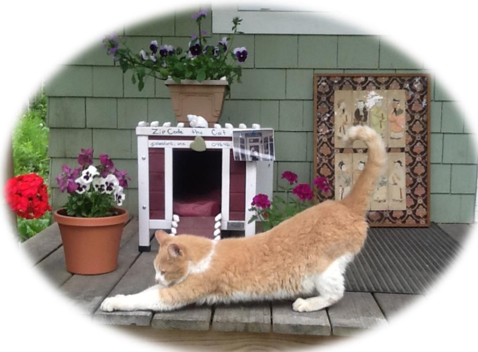
Zip Code the Cat turns 20 this year