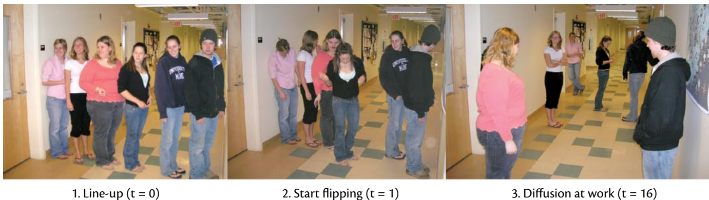
Figure 2. Physical simulation of random walk representing microscopic diffusion.