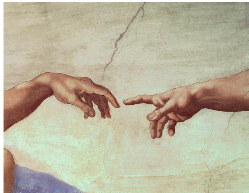
Creation of Adam by Michelangelo