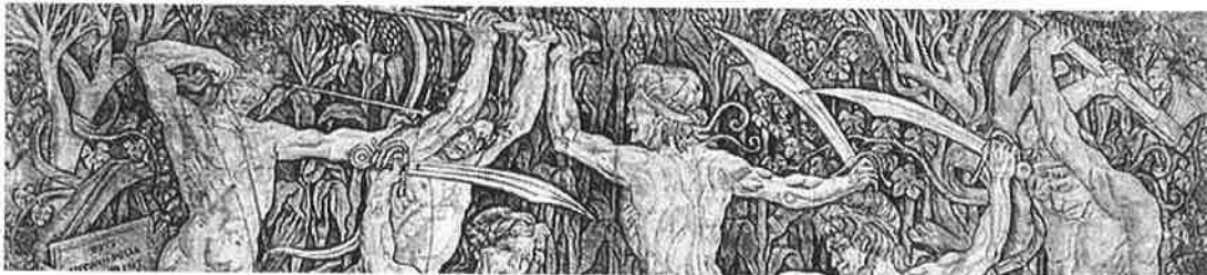
Antonio del Pollaiuolo, Battle of the Nudes, 1475 (Detail)