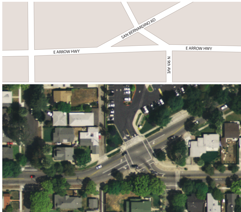
Figure 1: Map (Informing Design, Inc.) and aerial photo of mismatched Y-intersection

Another notable example of a naming problem occurred when the traveler was asked to turn on the second occurrence of passing a horseshoe shaped road on the right. In another case, the traveler was advised to turn the third time a particular road crossed the main road. In each case, responding simply to the name of the road would lead to a turning error.