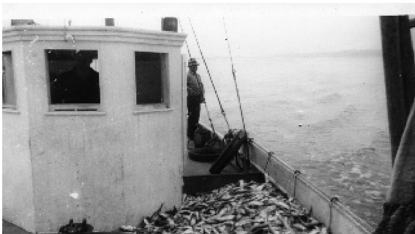
Pilothouse on seine boat with pile of fish aboard.

We will be seeking outside funding to expand the collection by scanning materials in archives in Canada, Europe, and Massachusetts and by including materials relating to freshwater fisheries in tributaries to the Gulf of Maine. On an ongoing basis, we will be seeking to acquire or digitize relevant unique materials that remain in private hands.