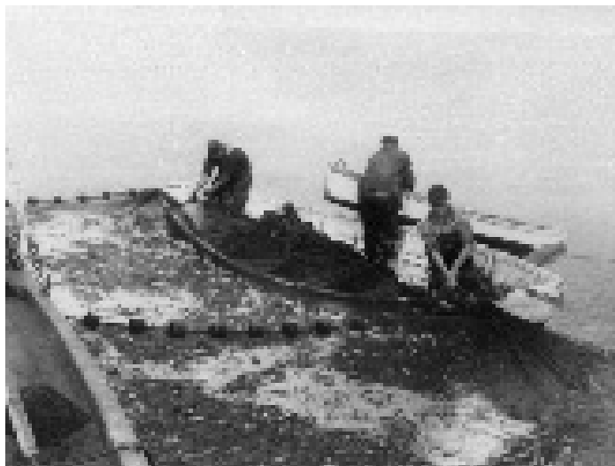
Herring catch on Monhegan Harbor.