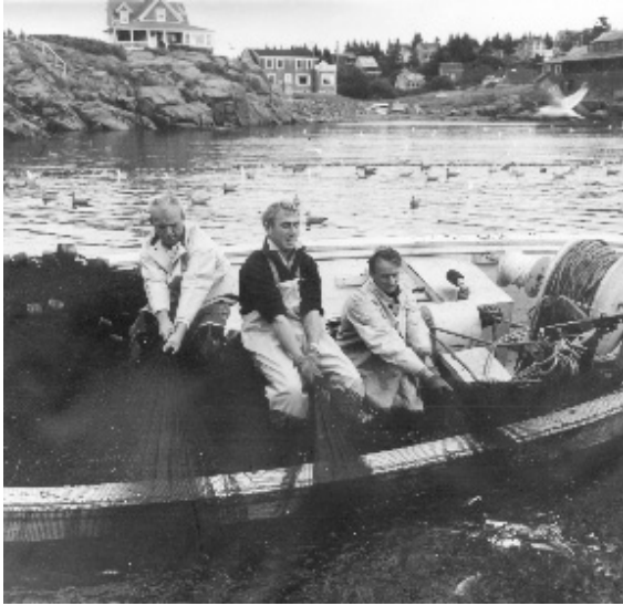
Preserving Maine's Sea Fishereis. Story on p. 3