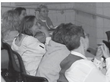
Volunteer station supervisors listen to a presentation during the RSVP training.