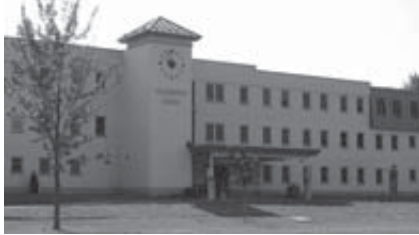
CoA's New Home, Camden Hall

The Center on Aging has relocated to the following address: