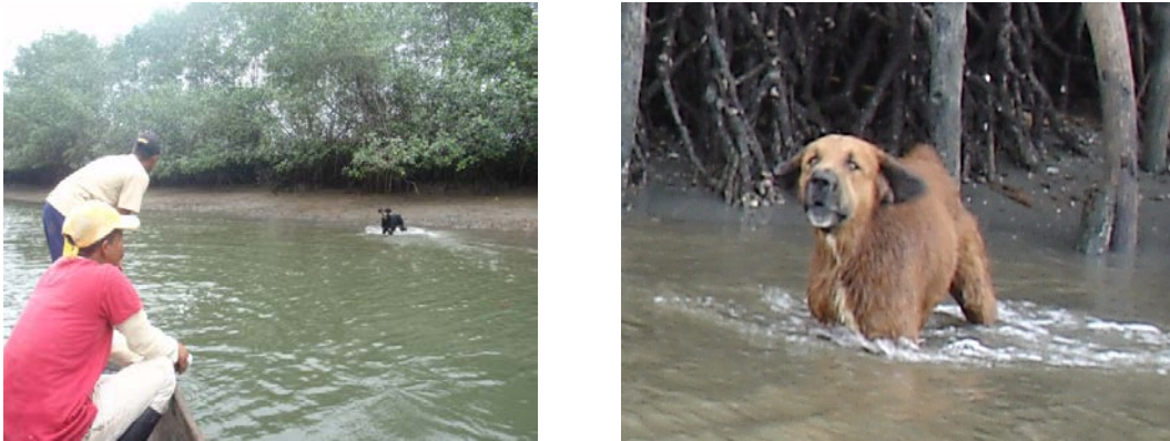
Figure 3: " Perros bravos " guard access to shrimp farms and deter cockle collectors and other artisanal fishers from getting too close and harvesting shells from the walls of a shrimp farm without special permission from the owner or guards on duty.

ponds or threaten the staff with machetes. Today conflicts with shrimp farmers are less common since many cockle collectors have made agreements or asked for special permission to work on the pond walls.