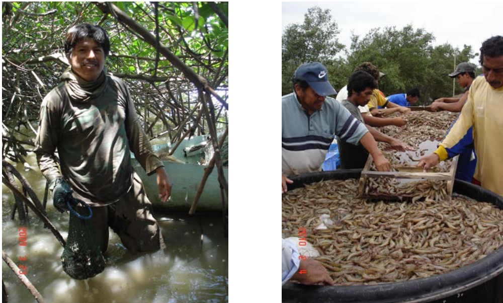
Figure 2: a) A cockle collector from Isla Costa Rica, El Oro with his total catch (left). b) A small-scale family shrimp farm in Muisne, Esmeraldas (right). While shrimp farms are designed to scale up production for surplus and export, the products from natural mangroves are estimated by FUNDECOL and C-CONDEM to support ten times the number of families compared to a small-scale shrimp farm.