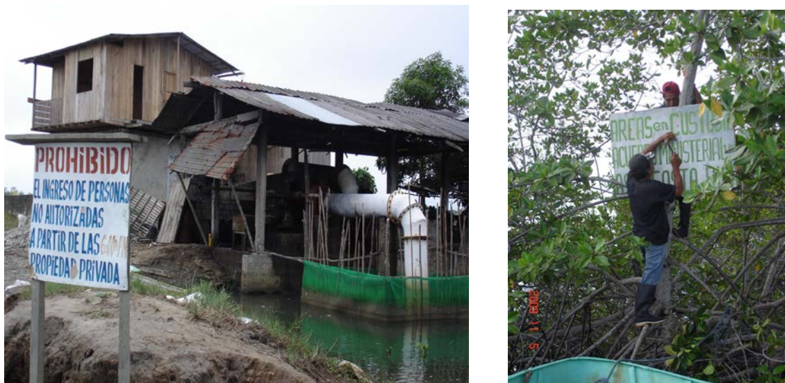
Figure 5: a) private shrimp farm prohibiting access by unauthorized persons b) two association members posting their sign delineating the boundaries of their custodia

Since 2000, Isla Costa Rica's custodia has enabled them to achieve the restoration of several mangrove areas, the recuperation of cockles and crabs, and the strengthening of local organization by patrolling and controlling access to gathering grounds (Bravo 2006). In addition to improved catch and shell sizes due to strict management of cockle gathering grounds by rotation, periodic closure, and exclusion of outsiders, the custodias have generated a sense of pride within the community historically marginalized by their isolation and lack of access to education, employment, and infrastructural development (Beitl 2011). However on a broader scale, the very custodias designed to defend artisanal fishers from the loss of mangroves are becoming a source of tension and conflict between members of associations and non-affiliated cockle collectors who are increasingly losing their ground in El Oro Province (Figure 5).