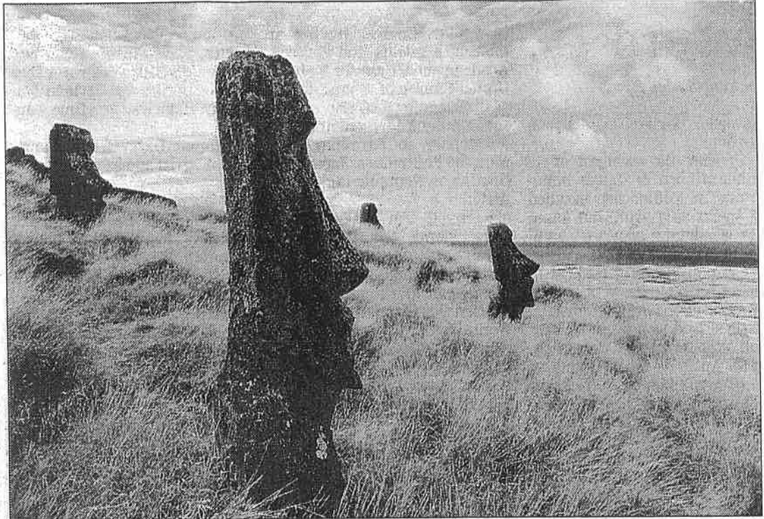
Kenro Izu's "Maui at Rano Raraku, Easter Island, 1989," platinum palladium print on watercolor paper.