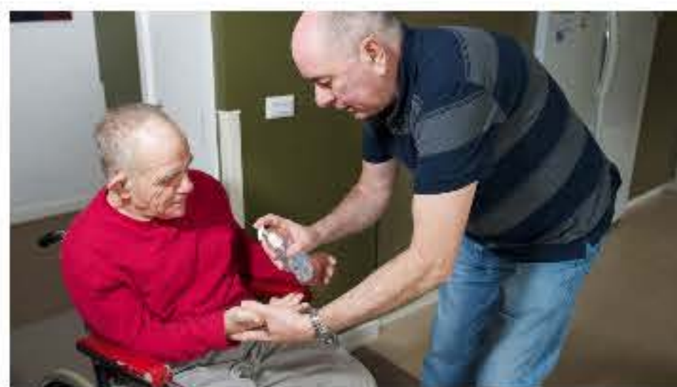
Professionals, Providers, and Direct Support Professionals