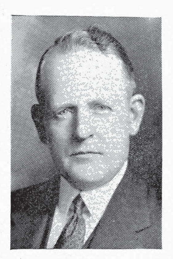
Mayor WILFRID LANDRY