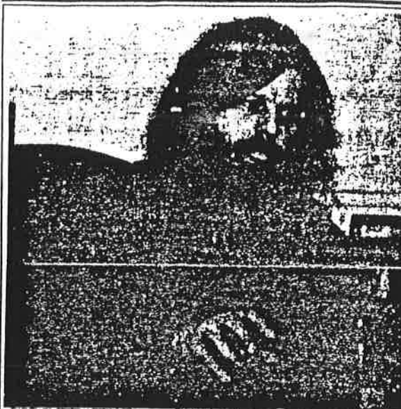
Christopher Cayan/YDN Staff

NEW HAVEN, CONNECTICUT COPYRIGHT 1995. 40 Cents Vol. 117, No. 91