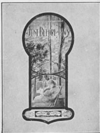
"Just Before the Dawn" has many admirers. It is a Clever, Original and Pretty Song, containing a Heart-Touching Story admirably told, and has a Chorus just such as you would make a pet favorite. Price, 50 Cents.

SPECIMEN SKETCHES OF SUPERIOR SENTIMENTAL SONG SUCCESSES OF SURPASSING MERIT. SOME SWEET AND SOFT. SOME SAD AND SERIOUS. SOME STRIKING AND STARTLING. BUT ALL OF THE SATISFACTORY SORT STRONGLY SOUGHT