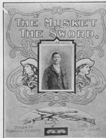
A Martial March Song of More Merit than any other in its class. Original, Inspiring. A Ringing Melody with the haunting quality of a lasting hit. Price, 50 Cents.

STOP AT SOME SHOP SELLING SHEET MUSIC AND SECURE SOME OF THESE SUPREME AND STERLING STANDARD SONG SUCCESSES OR SEND 25 CENTS IN STAMPS OR SILVER AND HAVE SAME SENT STRAIGHT FROM THE PUBLISHER