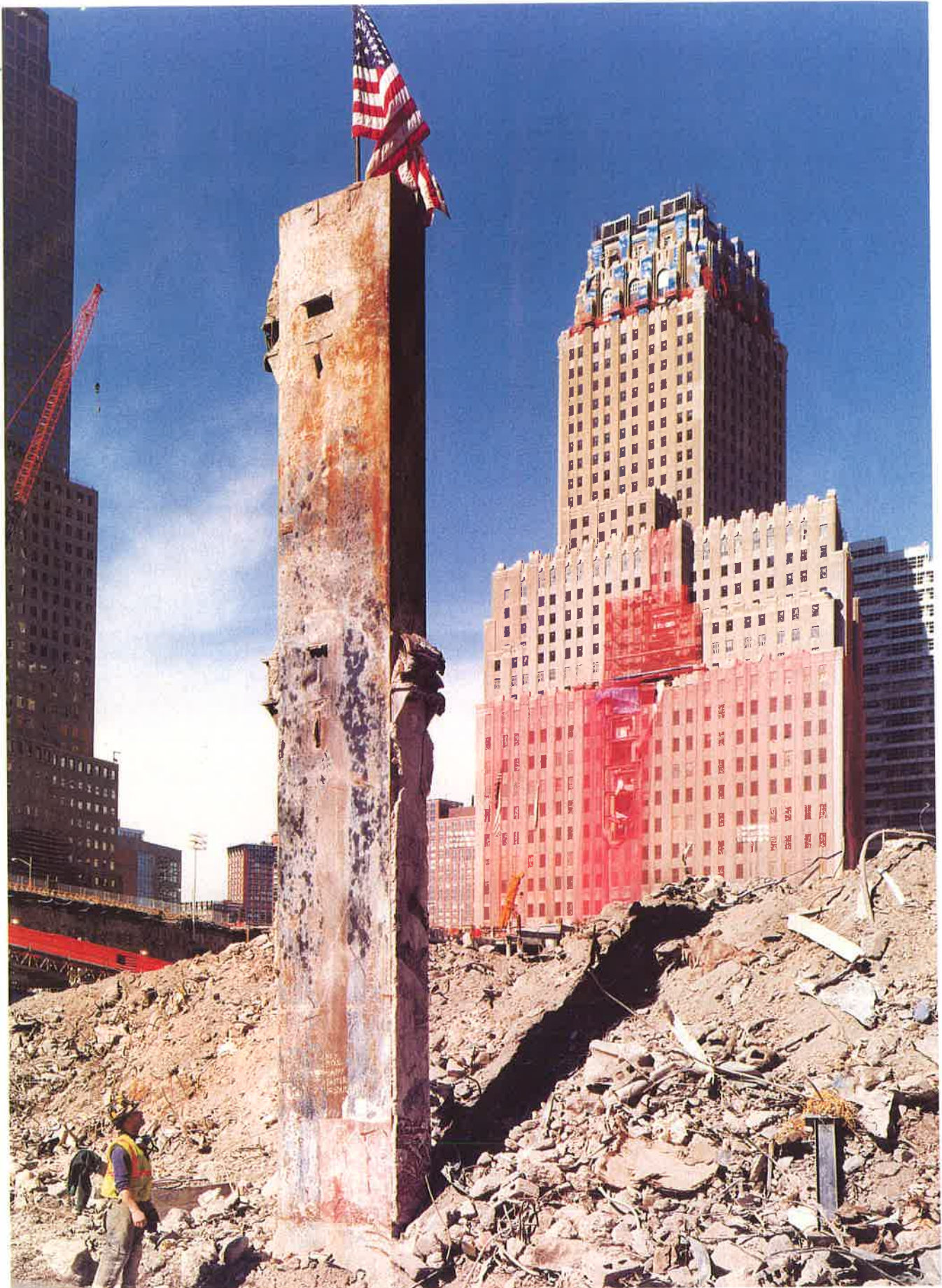
A column from the south tower, which will be the last piece of the buildings to be removed from the site. March 30, 2002.