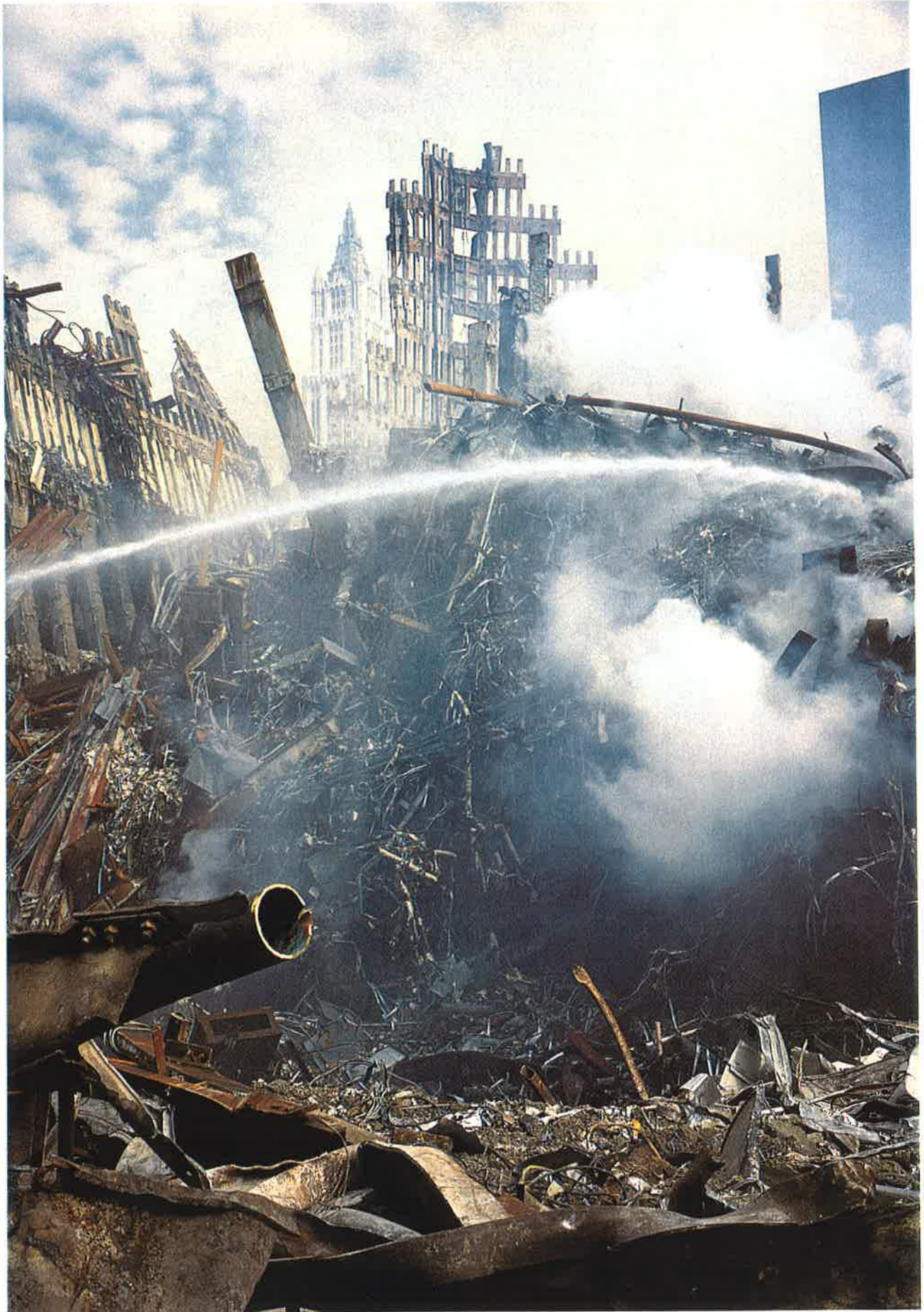
The eastern view from the base of the north-tower pile. September 23, 2001.