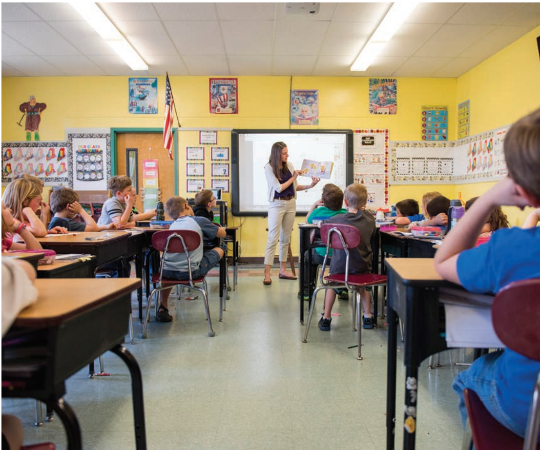
One hundred percent of COEHD students passed the PRAXIS II examination, the primary exam used across UMaine's teacher certification programs.