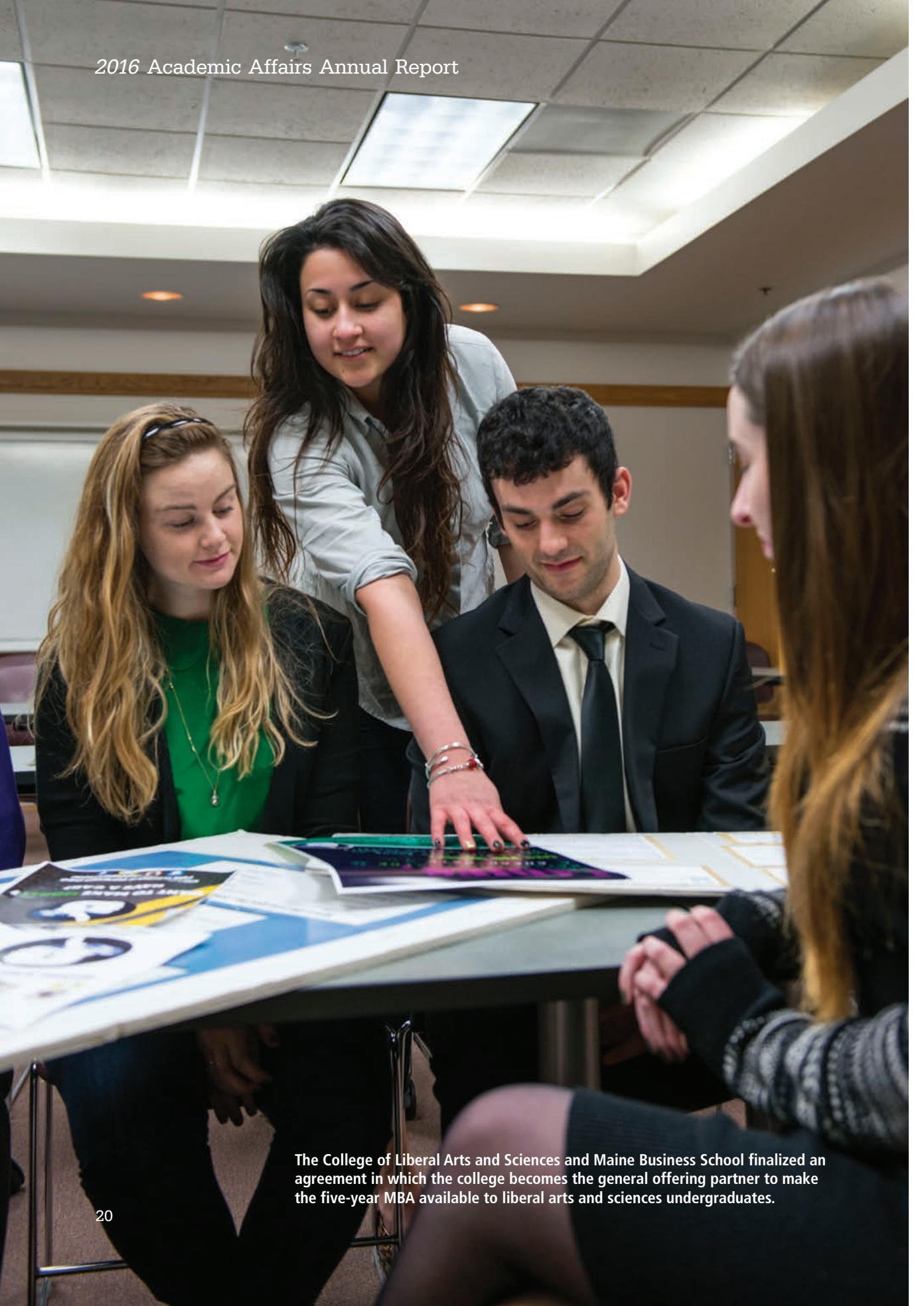
The College of Liberal Arts and Sciences and Maine Business School finalized an agreement in which the college becomes the general offering partner to make the five-year MBA available to liberal arts and sciences undergraduates.