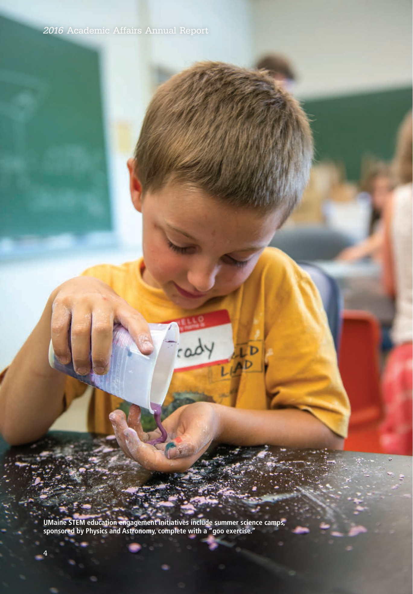
UMaine STEM education engagement initiatives include summer science camps, sponsored by Physics and Astronomy, complete with a "goo exercise."