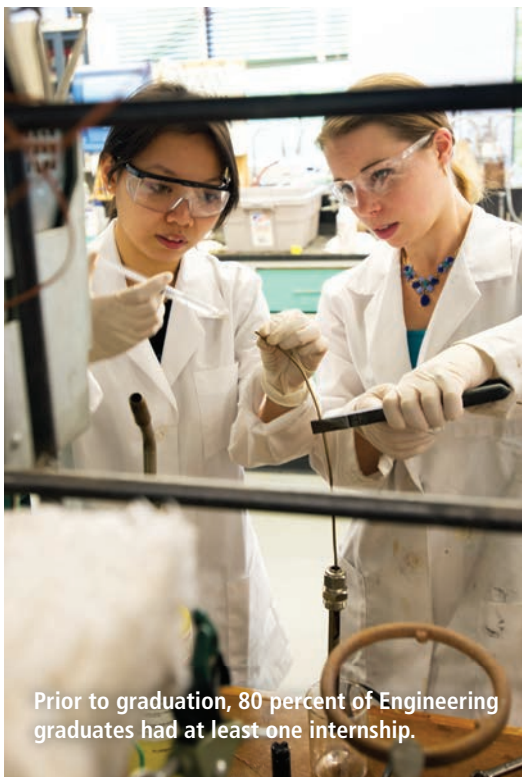
Prior to graduation, 80 percent of Engineering graduates had at least one internship.