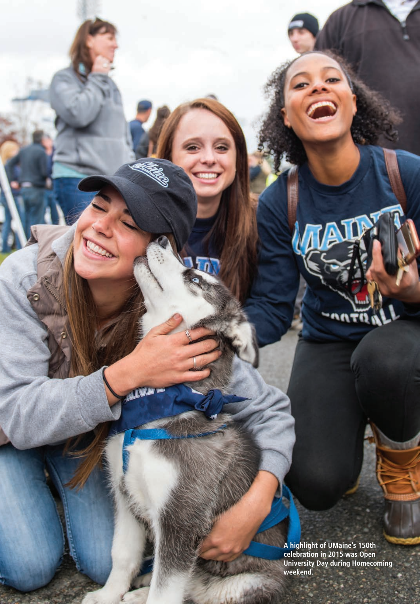
A highlight of UMaine's 150th celebration in 2015 was Open University Day during Homecoming weekend.