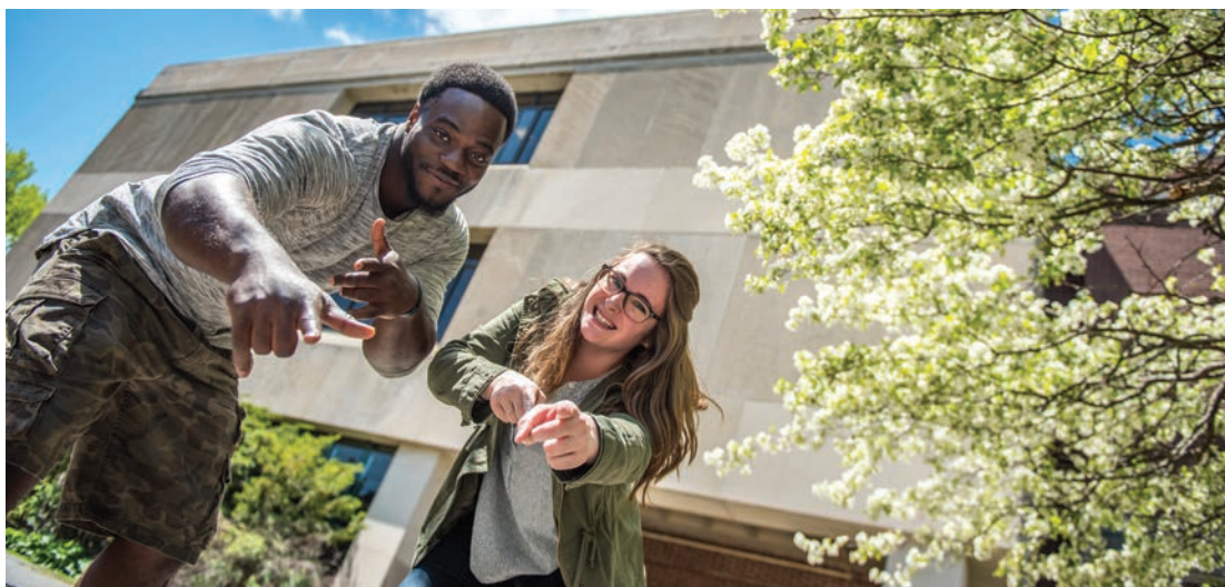
UMaine is welcoming the largest incoming class in fall 2016.