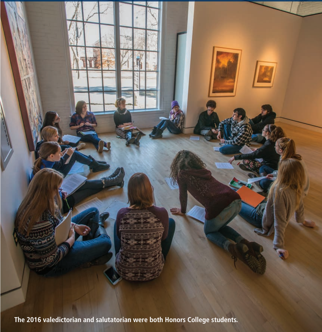
The 2016 valedictorian and salutatorian were both Honors College students.

For over 150 years the University of Maine has fulfilled the land grant mission – providing affordable education to Maine citizens, advancing the state’s economy, and serving its communities. The activities and accomplishments of the 2015–16 year illustrate UMaine’s ongoing commitment to this mission. The 2016–17 year will undoubtedly present challenges and opportunities. We look forward to working with UMaine’s outstanding faculty, staff, students and stakeholders to meet the challenges and realize the opportunities.